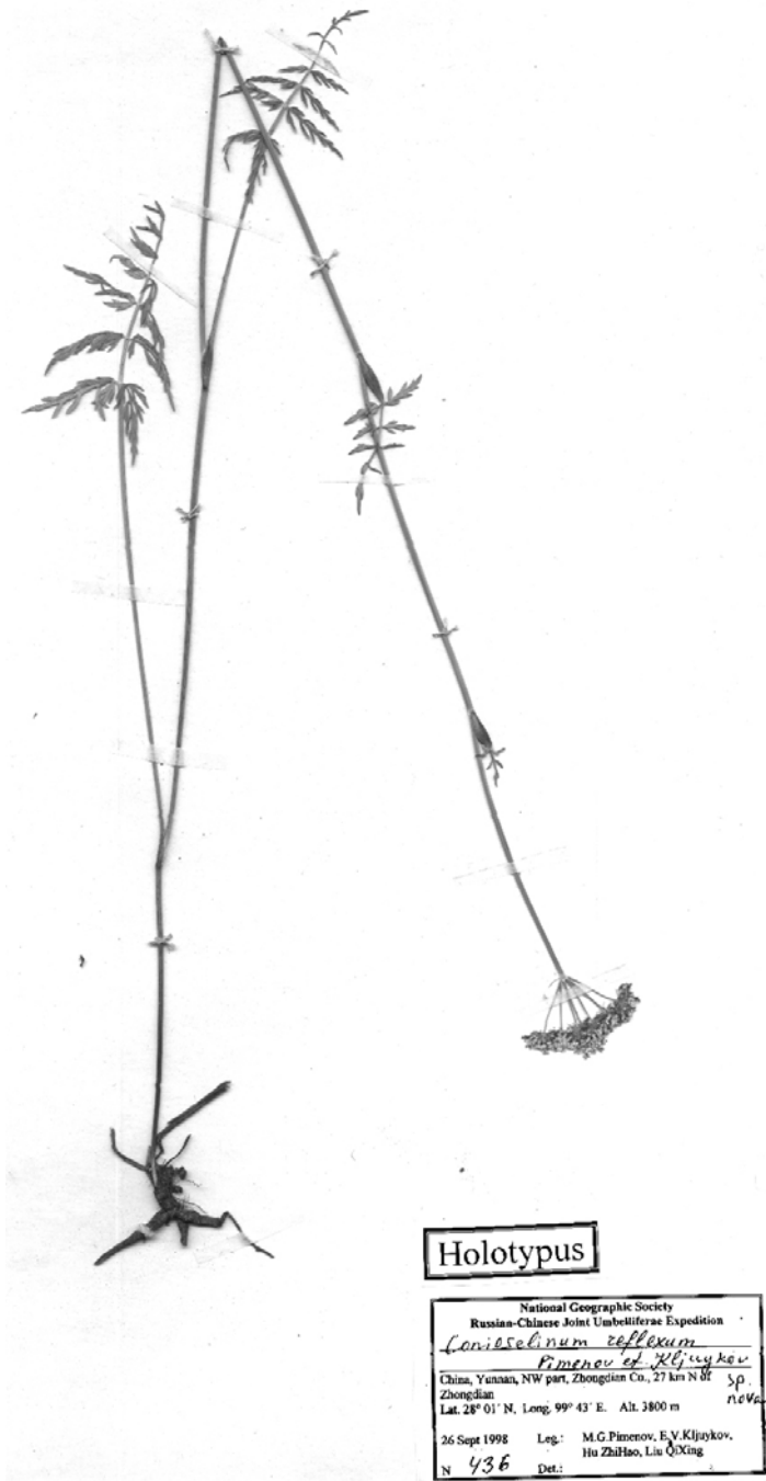
Fig. 12. Conioselinum reflexum – holotype.