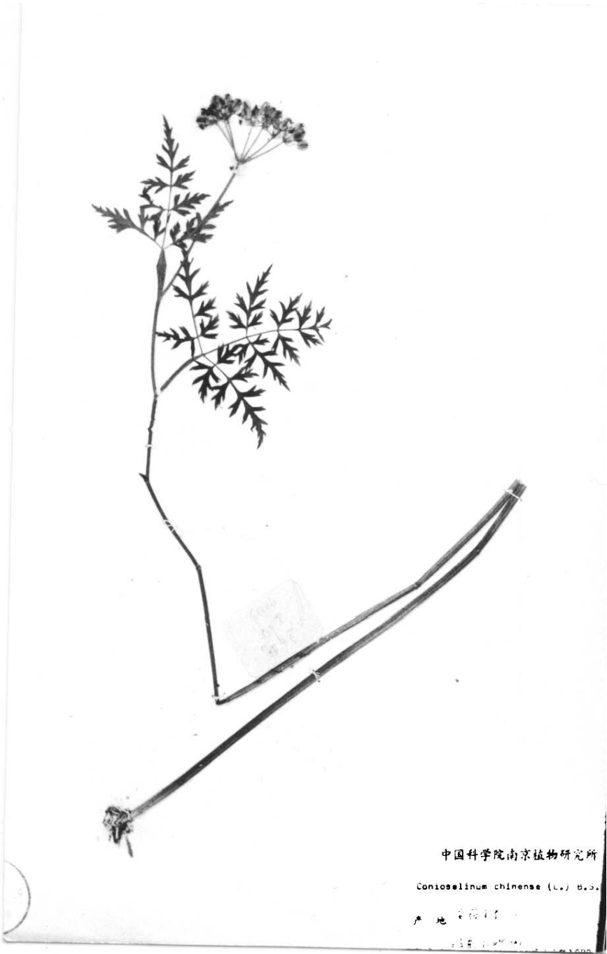
Fig. 13. Conioselinum shanii – holotype.