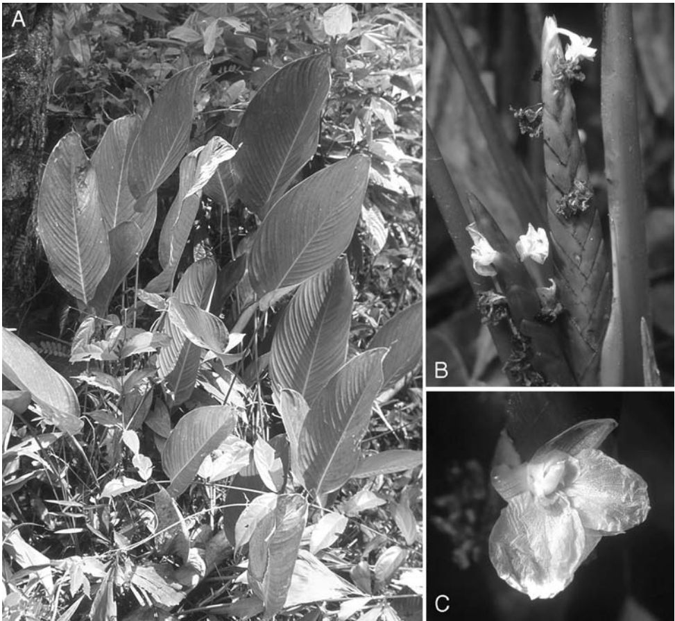
Fig. 2. Stachyphrynium longispicatum Suksathan & Borchs. – A: habit; B: inflorescence at anthesis; C: close up of flower. – Photographs by P. Suksathan, from the type locality.

by Holttum (1951), who discussed the taxon as Stachyphrynium sp. in his key and descriptions. Lack of complete flower material, however, prevented Holttum from describing it as a new species. Based on examination of flower remnants present in the inflorescence of the specimen seen by Holttum, he described the sepals as being 8 mm long; re-measurement done by us shows that the sepals are in fact no longer than 3.8 mm, i.e., within the range of flowers from Thai specimens of S. longispicatum .