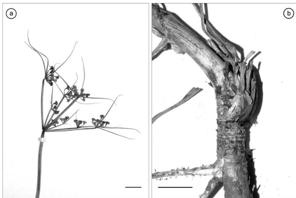
Fig. 3. Peucedanum longibracteolatum , photographs of herbarium material ( Ulrich 3/30 [holotype]) – a: compound umbel, flowering (note the extremely unequal rays and long extended bracteoles; b: rootstock with petiolar remains. – Scale bars: 0.5 cm (a), 1 cm (b).

1220 m, Steilhang, Exp. E, 25.10.2001, Ulrich 1/142 (MSB [fruiting synflorescences]). – C4 İÇEL: Silifke-Kırobası, etwa 22 km N Silifke, 980 m, eingezäuntes, bebuschtes Gelände, 21.10.2002, Ulrich 2/61 (herb. Parolly [fruiting synflorescences]).