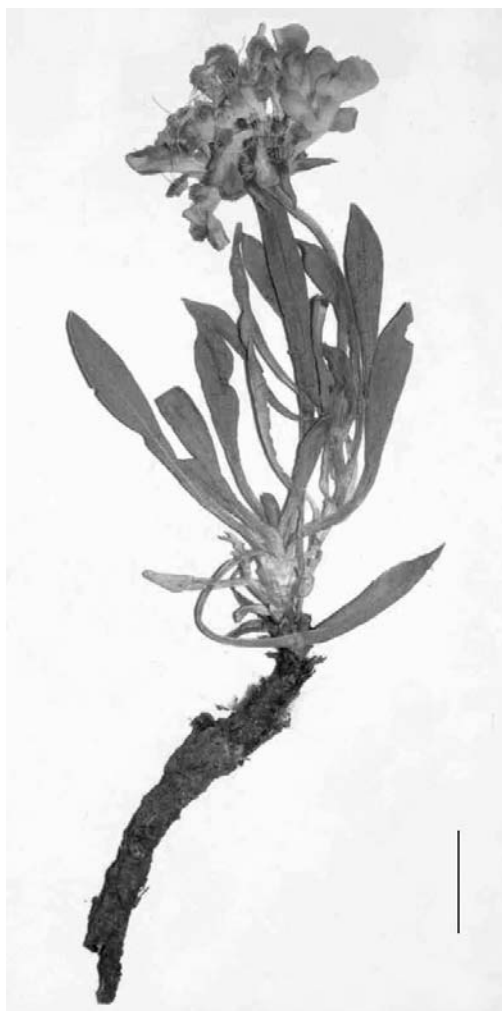
Fig. 1. Lomelosia solymica – specimen Ulrich 4/24a (herb. Parolly). – Scale bar = 1 cm.

(10-)15-35(-40) × 2-6 mm, narrowly obovate to spatulate or oblanceolate, tapering into a narrow base, apex mostly acute, less often mucronulate to obtuse. Stem leaves similar, but smaller in size than rosette leaves, very few, often reduced to bracts. Peduncle 1-2 cm long, c. 0.7 mm in diam., leafless. Capitula solitary, in flower flattened-hemispherical, radiant, (15-)20-25(-30) mm in diam., in fruit globose, 12-17 mm in diam. Involucral bracts 8, in two series, distinctly (3-)5-7-veined outside, variable in shape and density of the indumentum, outer surface thinly to densely pubescent, inner surface often glabrous; outermost bracts green, mainly with paler centres and purplish margins, ovate to ovate-lanceolate, often gibbous in the middle, 4-6 × 2-3 mm, apex apiculate to obtuse; innermost bracts similar but smaller in size, gradually merging into the receptacular bracts. Receptacular bracts white, with purplish or green tips, scale-like, keeled, oblanceolate to narrowly ovate, 3-5 × 1.2-2 mm, herbaceous with a hyaline membranous margin clearly dilated towards the base or only with herbaceous tip and vein, apex ± rounded, hairs as in involucral bracts but thinner. Florets 14-20, pale mauve, lilac to pinkish, the outer strongly radiant, 11-13 mm long. Corolla with a narrowly infundibuliform, white-lanate tube, c. 4.5-7 mm