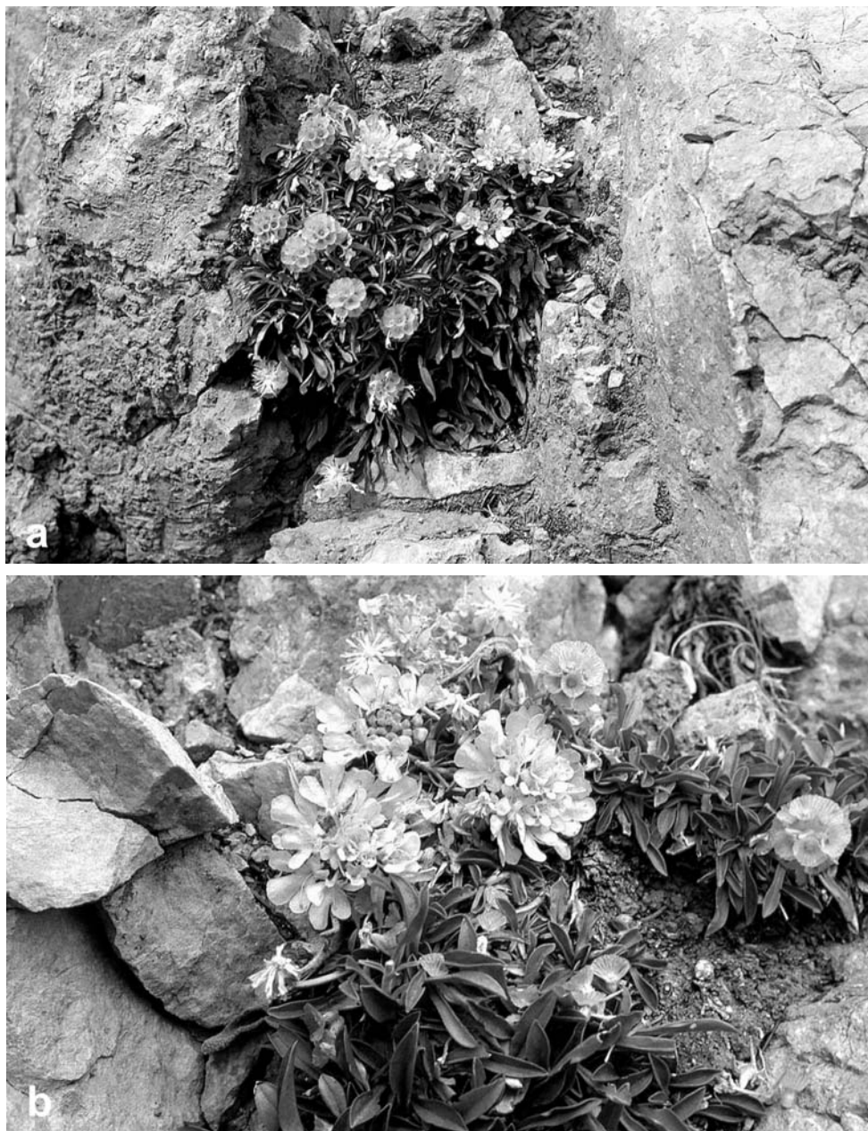
Fig. 2a-b. Lomelosia solymica in its natural habitat [Turkey, C3 Antalya, Tahtalı D.]; note the dispersed fruits in b.

long and with (4-)5 very unequal lobes, outside loosely lanate-pubescent, inside with scattered stalked glands; lobes of the 3 lower segments elliptic, obovate to narrowly ovate, 4.5-5.5 × 3-4 mm, the 2 upper broadly obovate, 2-2.5 × 2-2.5 mm. Stamens 4(-5), long exserted; filaments whitish to rarely pale purplish in upper part, 6-12 mm long, flattened, winged; anthers pale pinkish