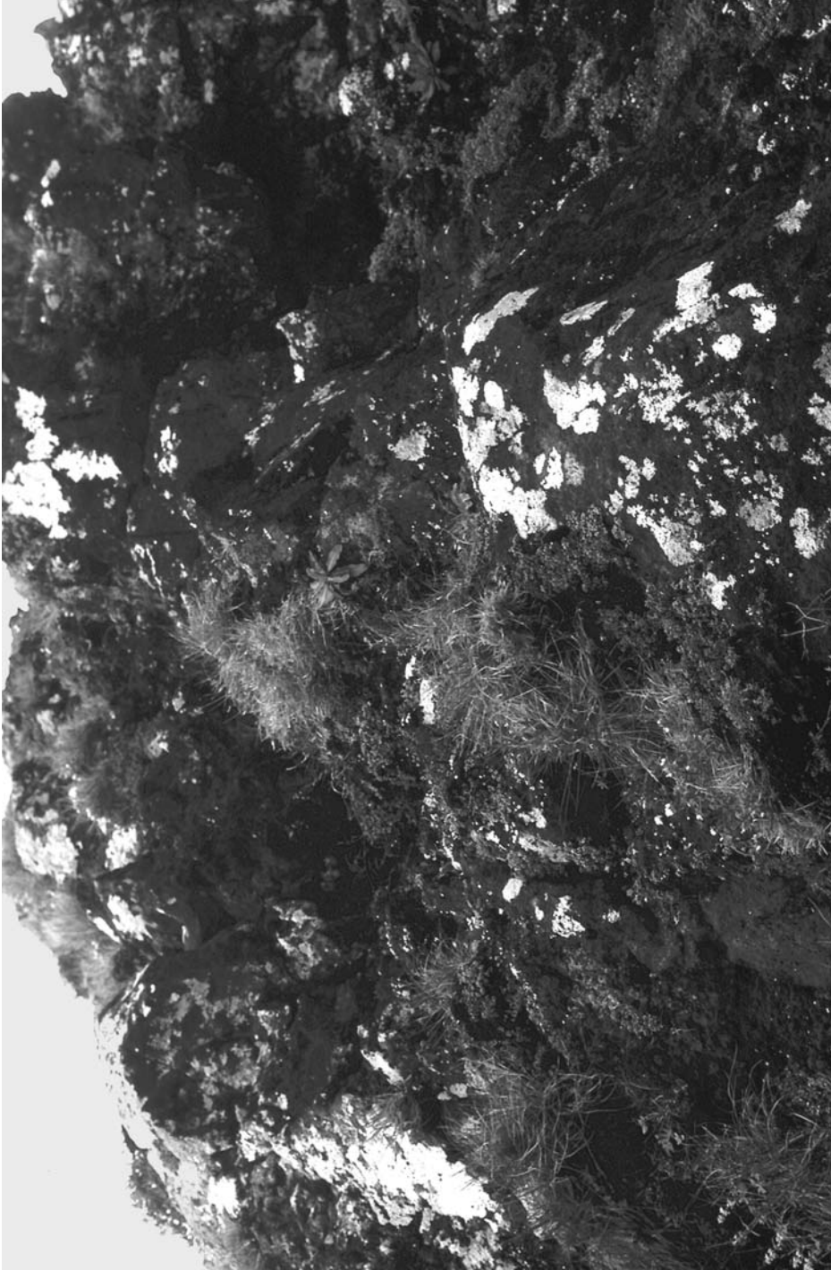
Fig. 2. Lolium saxatile in its habitat on Fuerteventura in the northern escarpment of Pico de la Zarza, c. 800 m.