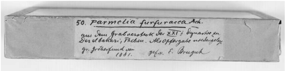
Fig. 2. Label (handwritten by G. Schweinfurth) for the sample of Fig. 1. Translation: “50. Parmelia furfuracea Ach. from hidden grave of XXI dynasty in Dez el bahari, Thebe. Laid down as offering. Large grave discovery of 1881. Found by E. Brugsch”. – Collection of Georg Schweinfurth at the Botanical Museum Berlin-Dahlem.

preted as referring to the lichen Aspicilia esculenta (Pall.) Flagey, whose thick wrinkled crusts when detached from rocks in significant quantities can be exploited as food or as fodder for the livestock (Richardson 1988). However, although this lichen is widespread in the Middle East, we have not found any published record from Egypt. It should be noted that there are several other interpretations of “manna from heaven”.