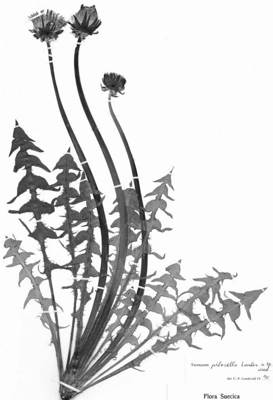
Fig. 6. Taraxacum pilosella , holotype (S).