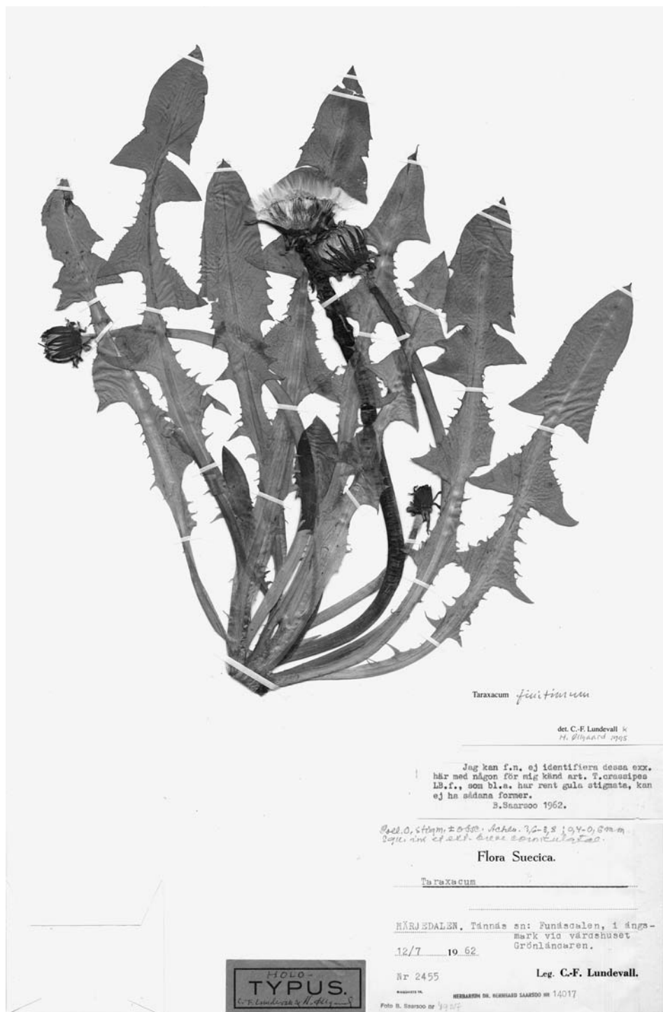
Fig. 3. Taraxacum finitimum , holotype (S).