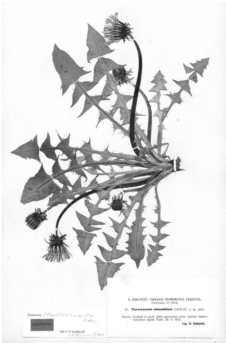
Fig. 5. Taraxacum obnuptum , holotype (S). Downloaded From: https://bioone.org/journals/Willdenowia on 01 May 2024 Terms of Use: https://bioone.org/terms-of-use