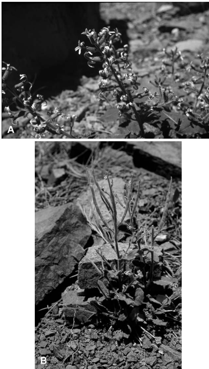
Fig. 2. Hesperis kuerschneri at its type locality SW Turkey, Denizli, Tuzla Beli, 1300 m – A: flowering, 7.5.2002 ; B: fruiting, 25.5.2005. Downloaded From: https://bioone.org/journals/Willdenowia on 30 Apr 2024 Terms of Use: https://bioone.org/terms-of-use