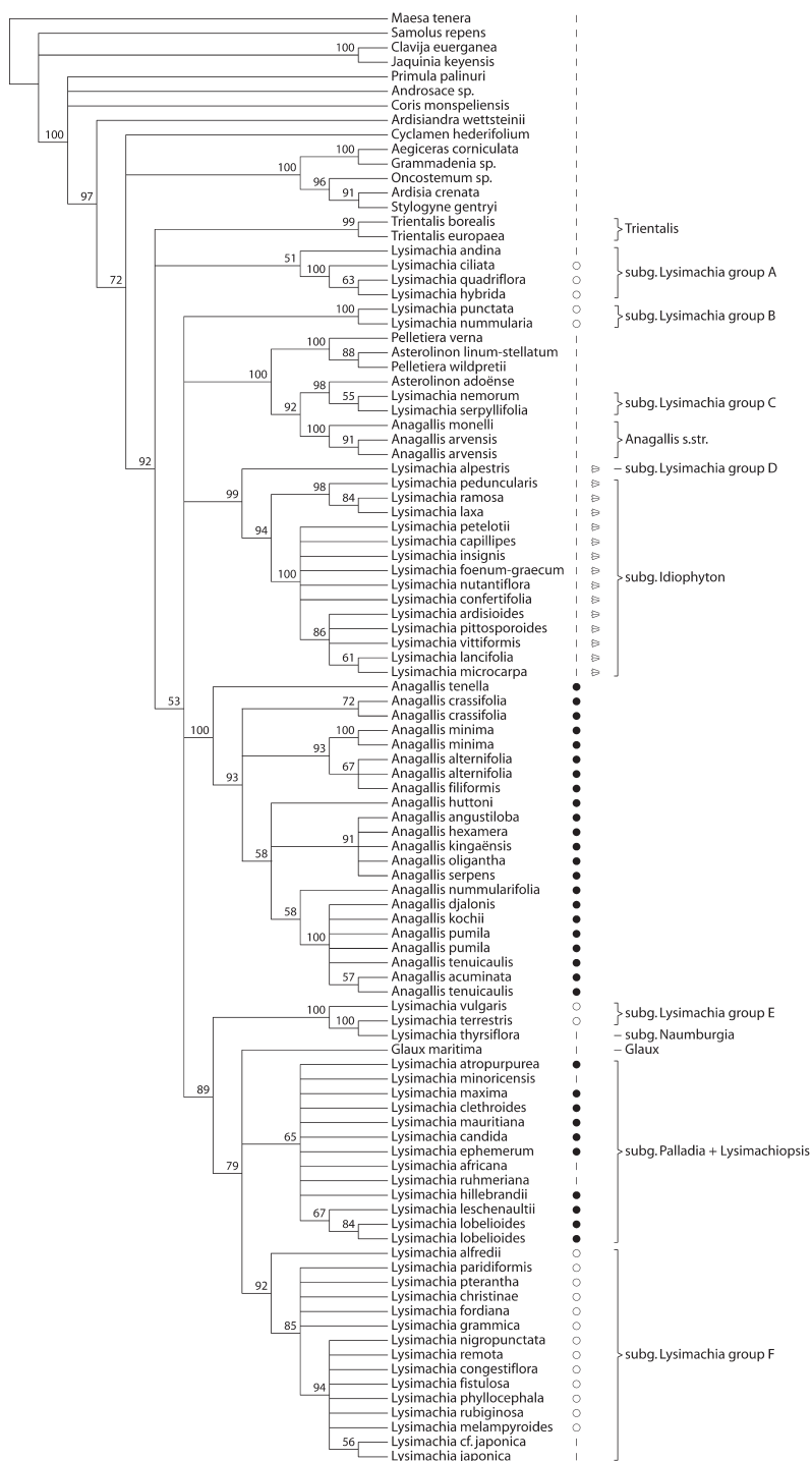
Fig. 1. Jackknife tree obtained from the Xac analysis of ndhF . Jackknife support values (> 50 %) are indicated above the nodes. ○ = Flowers with oil-producing trichomes; ● = flowers with nectar-producing trichomes.