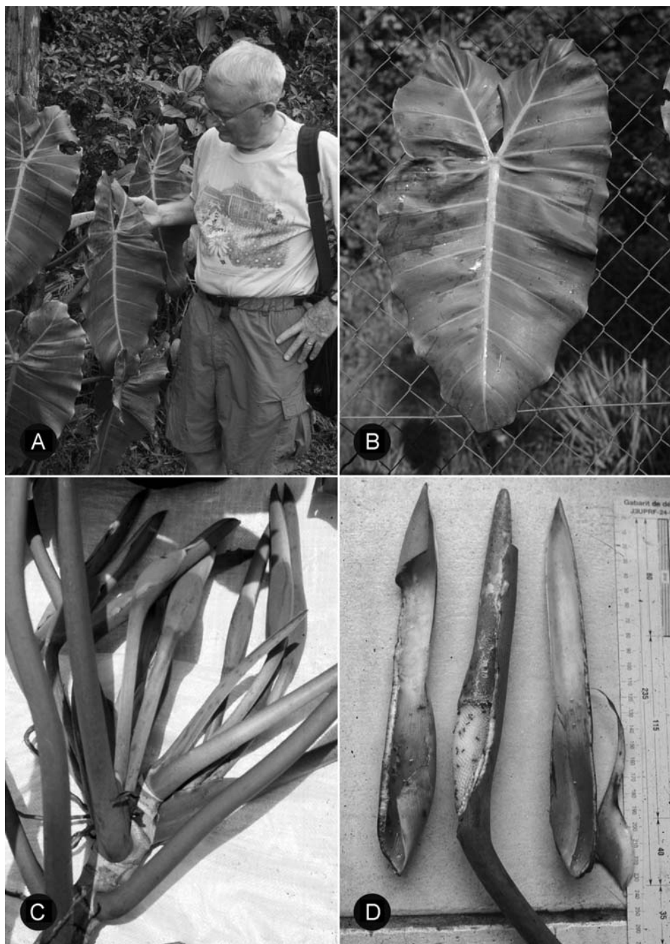
Fig. 2. Philodendron scottmorianum – A: habit of plant in cultivation with Dr Scott Mori at Emerald Jungle Village, French Guiana; B: leaf blade showing adaxial surface; C: stem with bases of petioles and clusters of inflorescences borne in two different leaf axils; D: inflorescence cut open to expose the inner surface of spathe and the spadix (centimetre ruler to show scale).