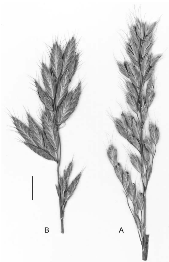
Fig. 1. A: Bromus parvispiculatus (from the holotype, Willing 87413). – B: B. hordeaceus subsp. mediterraneus (France, Var, 1860, F. Schultz, herbarium normale, nov. Ser. Cent. 13, No. 1272 as B. molliformis ). – Scale bar = 1 cm.

of glumes and lemmas on drying, a relative high lemma awn insertion of 0.5-1.7 mm below the obtuse or short-bilobed lemma apex as well as the more or less spreading, softly and densely long-hairy indumentum at least on the lower leaf sheaths (except for B. hordeaceus subsp. longipedicellatus , a probably hybrid derivative; Spalton 2001). The interrelationships of all these taxa are obscure. Some similarities in the loose panicle configuration of B. hordeaceus subsp. pseudothominei (6.5-8 mm long lemmas; the mostly non-weedy subsp. thominei , similar in lemma size, differs, e.g., by its compact inflorescences!) and B. parvispiculatus may one lead to the assumption that the latter is the Mediterranean vicariant of the more northerly distributed subsp. pseudothominei and should therefore better be treated as a subspecies of B. hordeaceus .