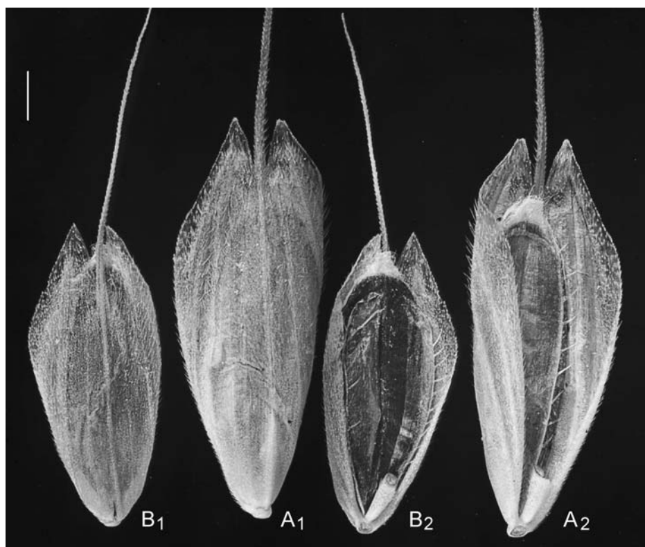
Fig. 2. Florets in fruiting state (1 = dorsal and 2 = ventral view) – A: Bromus incisus (from Otto 10651); B: B. lepidus (from Otto 10461). – Scale bar = 1 mm.

The Herbarium of the Botanical Museum Berlin-Dahlem (B) holds a mounted specimen of an annual brome grass obtained in 1946 from R. Gross, who himself received it from the National Her-