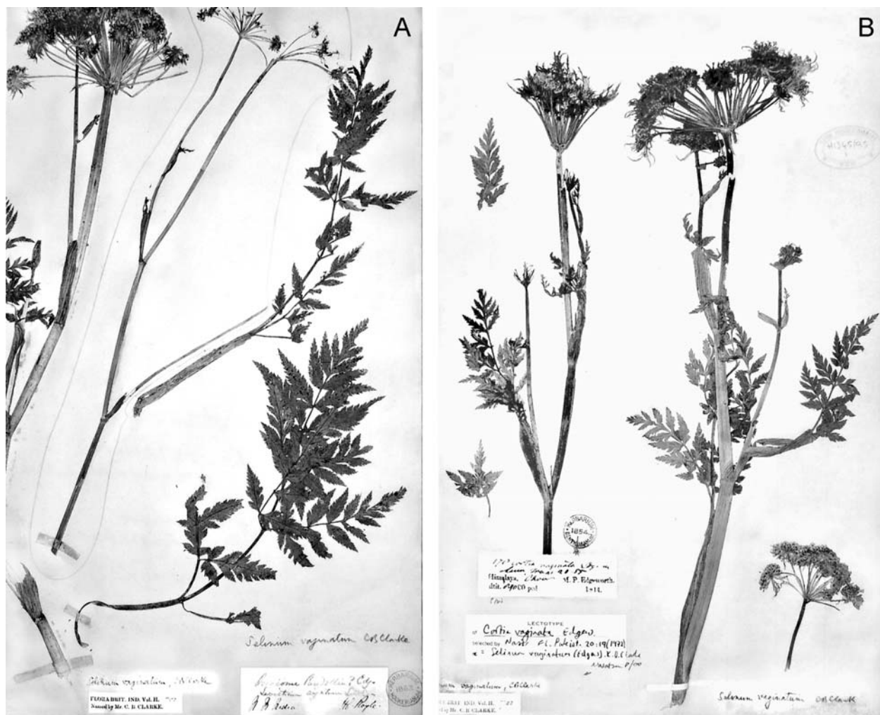
Fig. 1. Type specimens – A: Levisticum argutum Lindl. (K); B: Cortia vaginata Edgew. (K).

The name Selinum vaginatum , widely accepted at present, is based on Cortia vaginata Edgew. (Edgeworth 1845). However, Levisticum argutum Lindl. (Lindley 1835) refers to the same species, as a comparison of their type specimens, both kept in Kew (Fig. 1), revealed. Levisticum is a genus completely absent from the Himalayan flora. The description of L. argutum is rather short, and it is not surprising that the name was almost completely forgotten. Edgeworth (1845) and Clarke (1879) suggested (the latter with some hesitation) L. argutum was conspecific with Cortia elata Edgew. ( \equiv Ligusticum elatum (Edgew.) C. B. Clarke). Mukherjee & Constance (1993), however, did not confirm this synonymy.