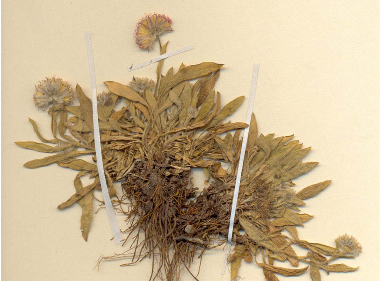
Fig. 1. Erigeron uniflorus subsp. parnassensis , holotype specimen.

nal collectors (C. D. Preston, pers. comm., 2007), there is no suggestion that the plants were collected from an unusual habitat or substrate, where conditions of stress might induce phenotypic modification.