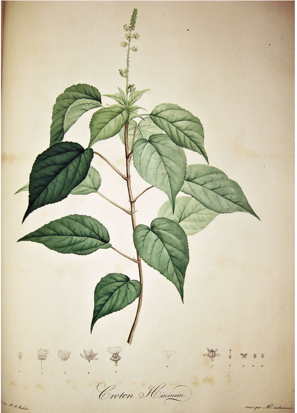
Fig. 1. Illustration of Croton hircinus in Ventenat (1803: t. 50), the designated lectotype of C. hircinus . Downloaded From: https://bioone.org/journals/Willdenowia on 23 Apr 2024 Terms of Use: https://bioone.org/terms-of-use