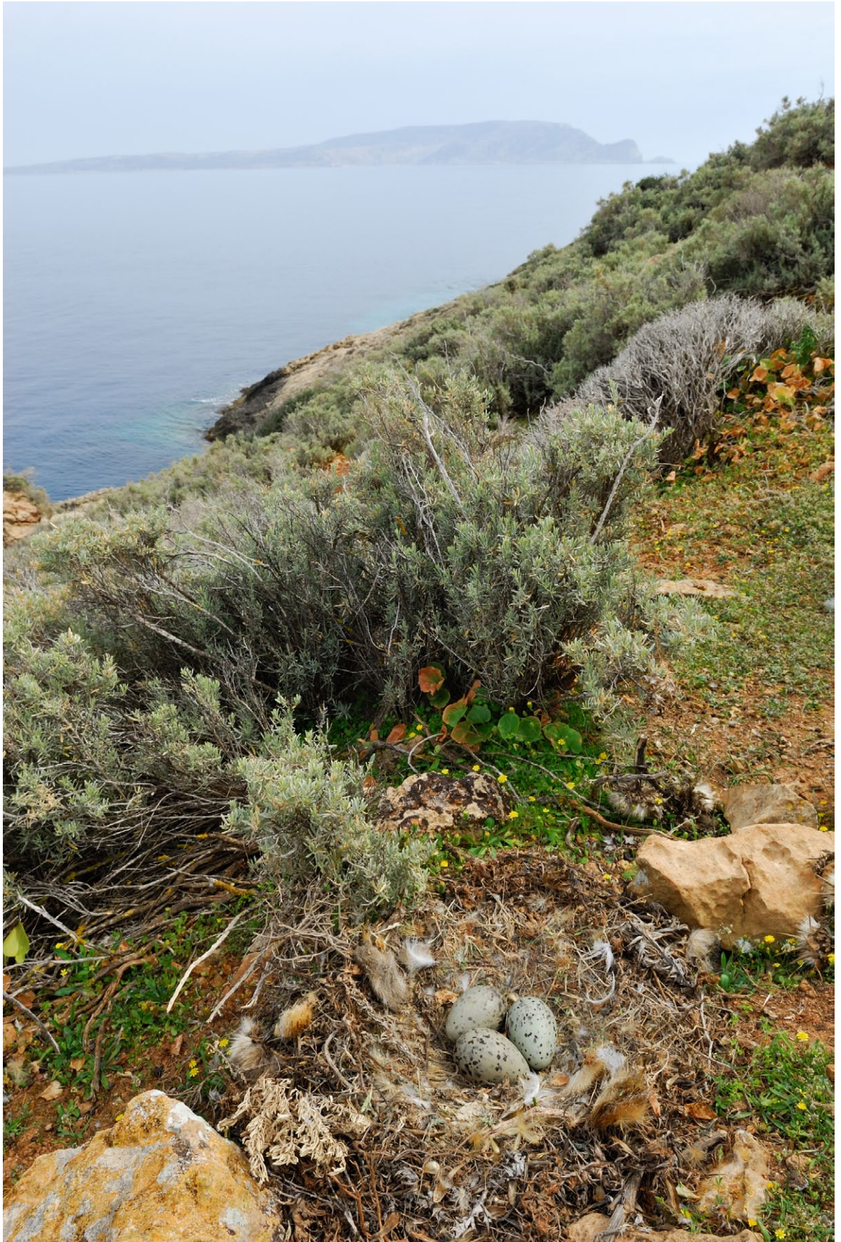
Fig. 3. Halo-nitrophytic scrub with Atriplex mollis on Gavdopoula in its single European locality, with gull's nest ( Larus michahellis michahellis ). – Photo by N. Turland, April 2009.