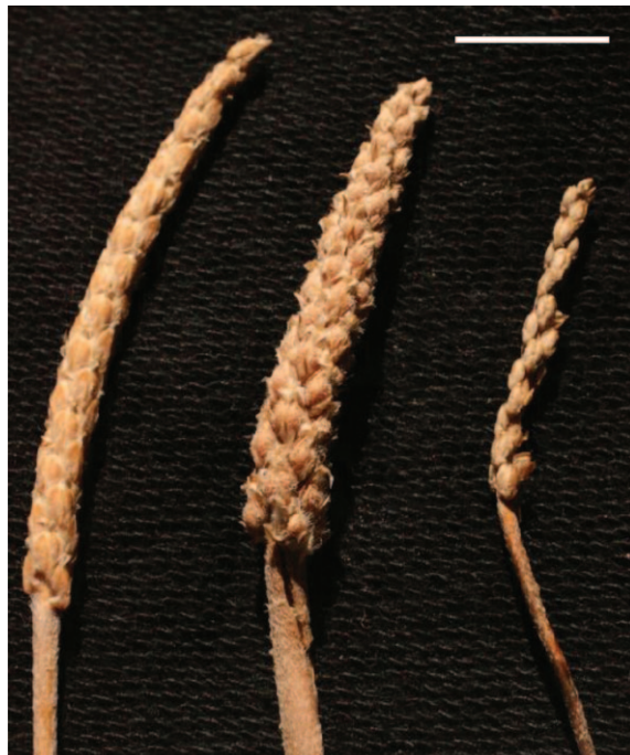
Fig. 2. Diagnostic spike shape and peduncle width in three species of Plantago in Israel: P. weldenii (left), P. crypsoides (centre), P. sabulosa (right); for details, see text. – Scale bar = 1 cm; photograph: A. Danin.

Feinbrun (1978: 223), in the Flora Palaestina area, recognises two varieties within Plantago coronopus subsp. commutata (Guss.) Pilger: var. commutata (Guss.) Bég. and var. crassipes Coss. & Daveau. Zohary (1938: 228), in his mono-