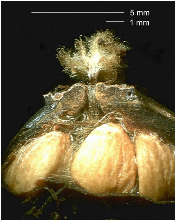
Fig. 4. Rosa micrantha subsp. chionistrae – cross section through the upper part of a hip collected in November, sepals dropped off; disc broad, orifice narrow, styles villose (Hand 3684).

exceeding 1 cm in length, glandular-setose with a few scattered hairs [ T : in the photos most pedicels are hidden by bracts; the three visible pedicels are smooth or sparsely glandular-setose / P : “pedunculis nudis vel raro glandulis stipitatis nonnullis instructis” / M : more or less densely glandular-setose (Fig. 3)]; receptacle narrowly ovoid or ellipsoid at anthesis, about 1 cm long, 0.4–0.5 cm wide, glabrous or thinly glandular-setose at the extreme base; sepals foliaceous with 4–6 narrowly [ M : about 1 mm wide] lanceolate lateral lobes, about 1.5 cm long, 0.4 cm wide at base, conspicuously glandular at the abaxial surface, spreading or reflexed [ M : reflexed] after anthesis, deciduous in fruit; petals white, broadly obovate, 2–2.3 cm long, about 2 cm wide, apex shallowly emarginate; stamens numerous, filaments glabrous, 2.5–3 mm long; anthers oblong, about 2 mm long, 1.5 mm wide; disk [ M : with a diameter of about 4.5 mm] prominent, conical [ M : low conical (Fig. 4)], glabrous, with an aperture about 0.7 mm diam.; styles free, pilose [ M : densely pilose, nearly lanate (Fig. 4)], forming a low dome about 3.5 mm diam. [ M : a little exserting above the orifice], stigmas capitate. Fruit broadly ovoid or subglobose [ M : ovoid, 1.2–1.5 as long as wide], about 1.5 cm long and 1.2–1.5 cm wide, scarlet; achenes bluntly angular, pale brown, about 5 mm long, 3 mm wide.