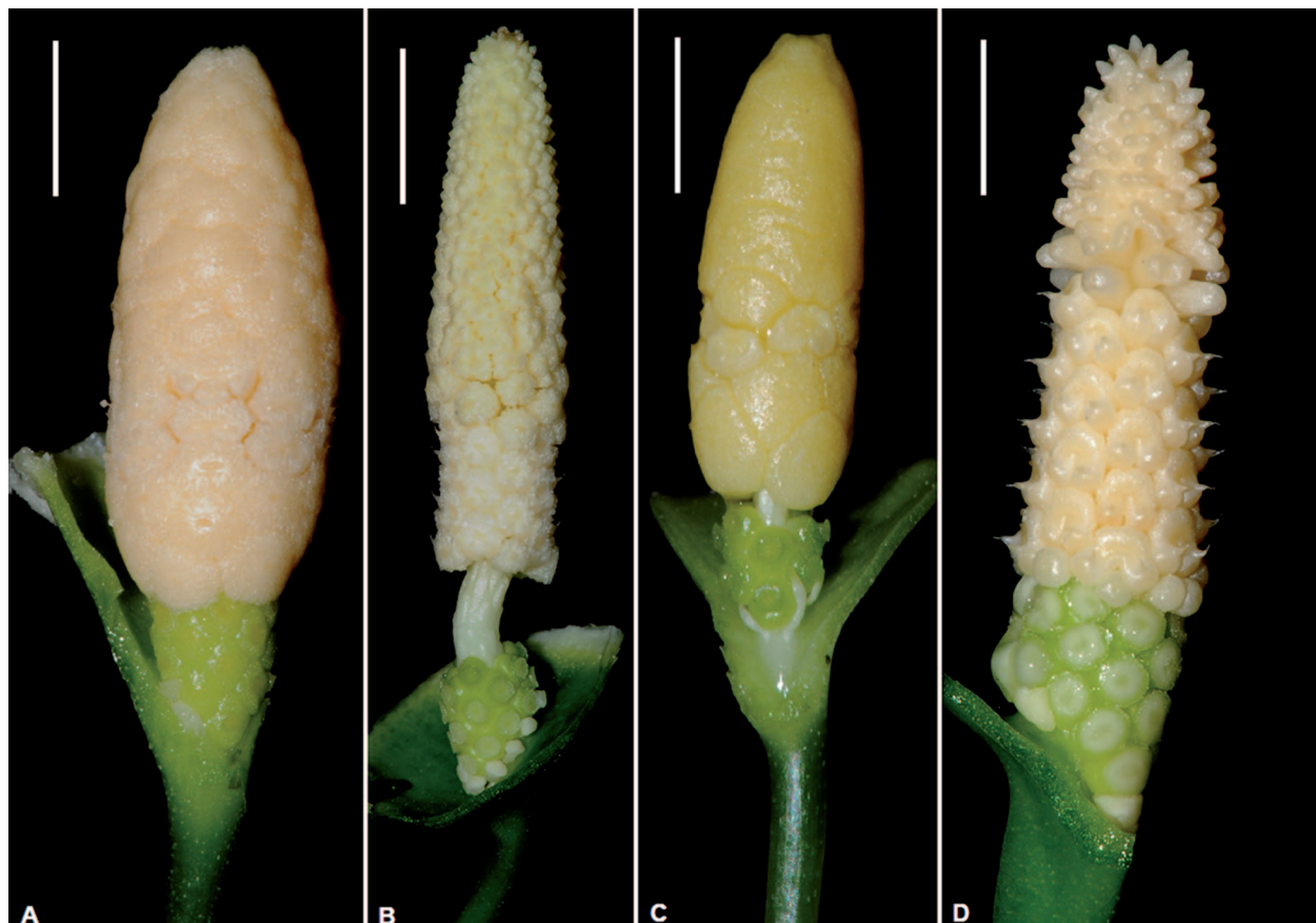
Fig. 3. Spadices (spathe artificially removed) in the Aridarum Burtii Complex – A: A. burtii from P. C. Boyce AR-3726; B: A. kazuyae from K. Nakamoto AR-3927; C: A. minimum from K. Nakamoto AR-3847; D: A. orientale from K. Nakamoto AR-3912. – Scale bar = 1 cm; photographs by P. C. Boyce.