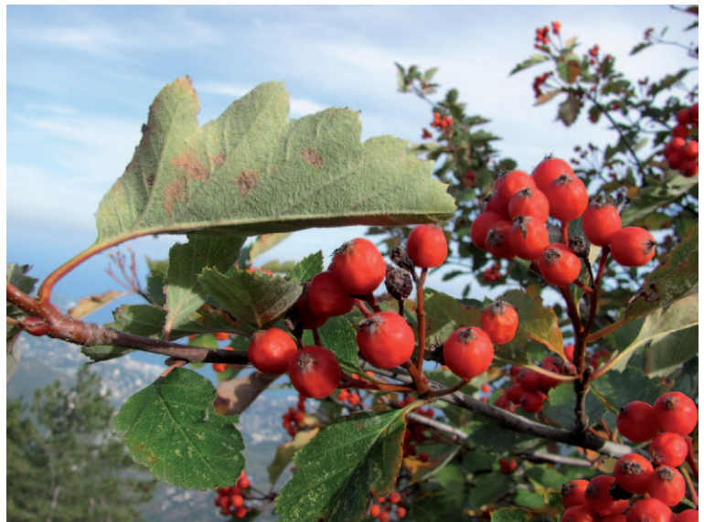
Fig. 6. Sorbus tauricola , fruiting branch showing the grey-green tomentose lower side of the leaves. – Crimea, Ai-Petri Mt, 25 Sep 2010. – Photo by P. Evseenkov.

ex Sennikov”; the name may not be attributed to Zaikonnikova alone under Art. 46.2.