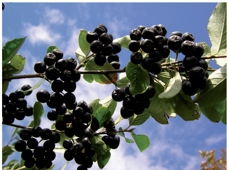
Fig. 2. Sorbaronia mitschurinii , fruiting branch. – Cultivation, 11 Sep 2004. – Photo by Yu. Vinogradova.

hybridogenous genus is Sorbocotoneaster Pojark. The natural hybrid between Sorbus aucuparia L. and Cotoneaster laxiflorus Lindl. (syn. C. melanocarpus (Bunge) Loudon), Sorbocotoneaster pozdnjakovii Pojark., was studied morphologically (Pojarkova 1953) and cytologically (Krügel 1992). Three distinct, yet sympatric, morphotypes were discovered: the primary hybrid (triploid) closely approaching S. aucuparia , the putative backcross with S. aucuparia (tetraploid) intermediate between the parents, and the putative backcross with C. laxiflorus (pentaploid) closely approaching C. laxiflorus . If it were not for the apomictic reproduction, A. mitschurinii would have been taxonomically included in S. fallax ; as far as its taxonomic separation is maintained, its transfer to Sorbaronia is justified and is consequently effected here.