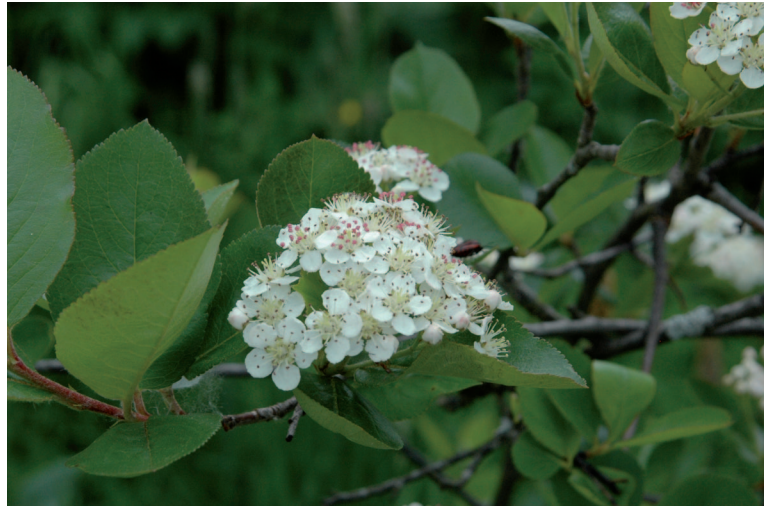
Fig. 1. Sorbaronia mitschurinii , flowering branch. – Cultivation, 29 May 2011.

In spite of the intergeneric origin, Leonard (2011) decided to maintain Aronia mitschurinii in Aronia because of its greater similarity to the species of the latter. However, an analogous case when variable intergeneric hybrids with Sorbus as one of the parents are accommodated in a single