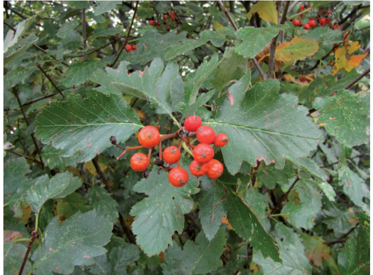
Fig. 5. Sorbus tauricola , fruiting branch showing the glossy upper side of the leaves. – Crimea, Ai-Petri Mt, 25 Sep 2010.

The Crimean whitebeams that belong to the apomictic complex of Sorbus latifolia (Lam.) Pers. s.l. were first discovered by Zelenetzky (1906), who identified them as “ S. scandica Fries”. Stankov (1927) reported the plant as S. latifolia . Popov (1959a) acknowledged the isolated occurrence of the Crimean plants and their difference from Central European whitebeams and described the Crimean populations as S. pseudolatifolia K. Popov. Popov provided an extensive description in Latin but designated two gatherings as types, one in flower and the other in fruit, making the new name not validly published under Art. 40.1. Zaikonnikova (1985) renamed the species because of homonymy but omitted the type designation, and this issue was also neglected in a recent list of Ukrainian type specimens (Fedoronchuk 2006). The name suggested by Zaikonnikova is in current use (Czerepanov 1995; Mosyakin & Fedoronchuk 1999; Zaikonnikova 2001; Yena 2012) and is validly published here. Under Art. 46.5 and 46.10 its authorship is “Zaik.