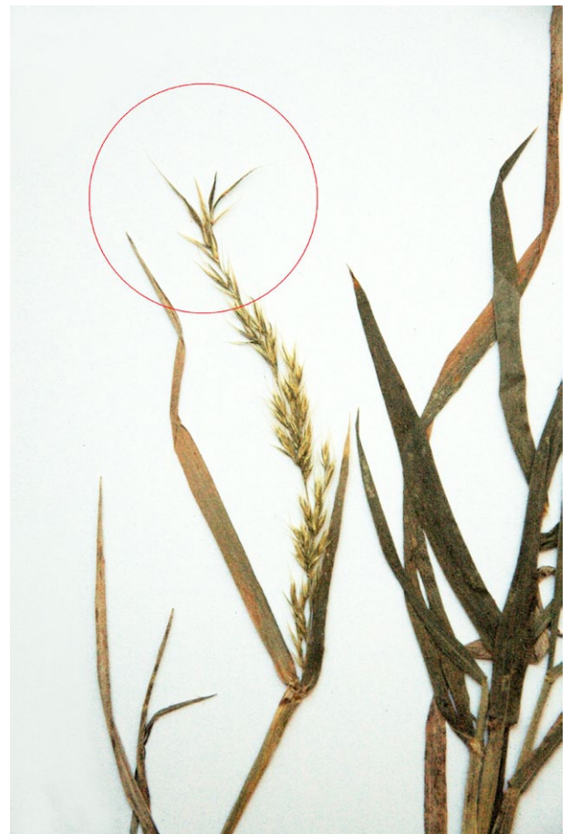
Fig. 4. Trisetum tamonanteae – panicle with a proliferated spikelet (‘‘plantlet’’), as a possible pseudoviviparous mechanism. – Paratype: A. Marrero (LPA 24805).

In the Poaceae pseudoviviparism has been recorded for at least 41 species in 13 genera (Pierce & al. 2003). It has been described for genera such as Dactylis L., Deschampsia P. Beauv., Digitaria Haller, Festuca L., Poa L., and Polypogon Desf., among others (Vega & Rúgolo de Agrasar 2006). The pseudoviviparism mechanism is generally associated with boreal or alpine species exposed to strong stress in nutrient-poor habitats (Elmqvist & Cox 1996; Pierce & al. 2003). The possible tendency to vegetative propagation by pseudoviviparism in T. tamonanteae