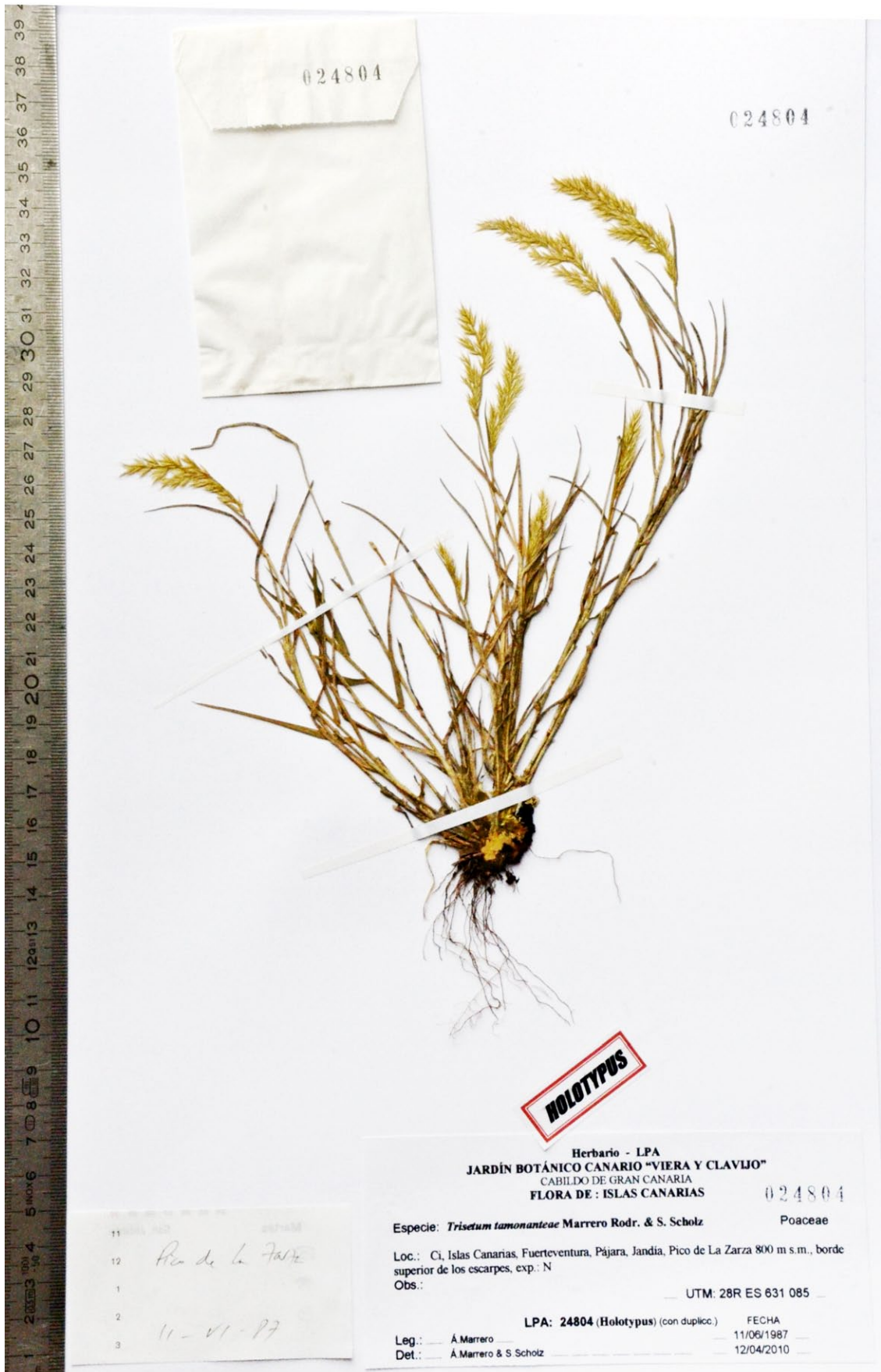
Fig. 1. Holotype of Trisetum tamonanteae – A. Marrero (LPA 24804).