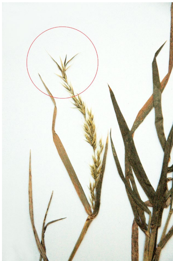
Fig. 4. Trisetum tamonanteae – panicle with a proliferated spikelet (“plantlet”), as a possible pseudoviviparous mechanism. – Paratype: A. Marrero (LPA 24805).

In the Poaceae pseudoviviparism has been recorded for at least 41 species in 13 genera (Pierce & al. 2003). It has been described for genera such as Dactylis L., Deschampsia P. Beauv., Digitaria Haller, Festuca L., Poa L., and Polypogon Desf., among others (Vega & Rúgolo de Agrasar 2006). The pseudoviviparism mechanism is generally associated with boreal or alpine species exposed to strong stress in nutrient-poor habitats (Elmqvist & Cox 1996; Pierce & al. 2003). The possible tendency to vegetative propagation by pseudoviviparism in T. tamonanteae