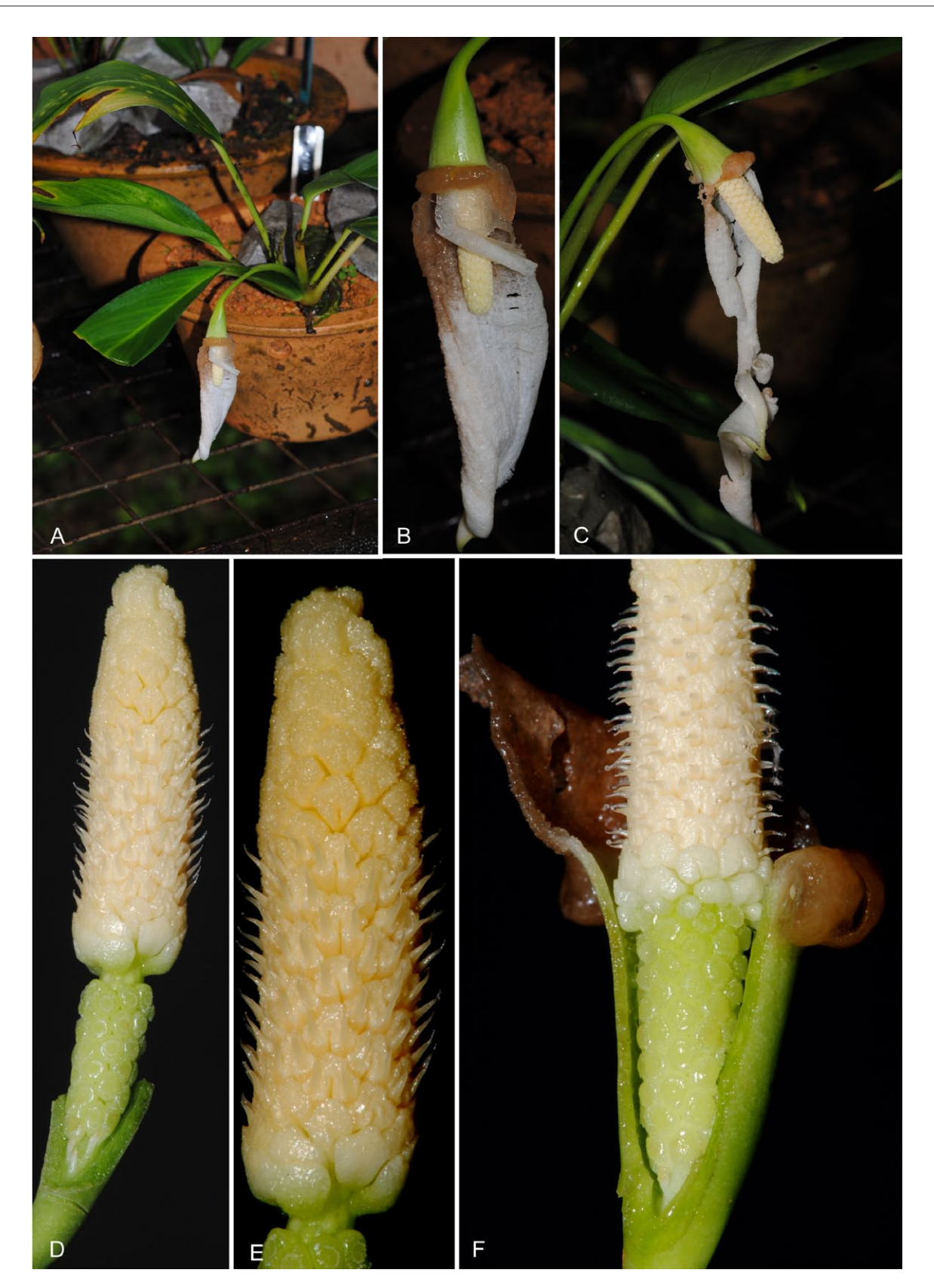
Fig. 3. Aridarum uncum – A: cultivated plant with inflorescence at staminate anthesis; note the pendent inflorescence, and the disintegrating spathe limb; B & C: inflorescence at staminate anthesis; D: spadix (spathe artificially removed) at end of pistillate anthesis; note that the interpistillar staminodes have yet to expand, and that the thecae horns are directed upwards; E: detail of appendix, staminate zone, and interstice staminodes; F: inflorescence at late staminate anthesis, with the lower spathe artificially removed; note the deliquescing remnants of the spathe limb, that the thecae horns have reflexed, many with a droplet at the tip, and that the interstice staminodes have expanded laterally.