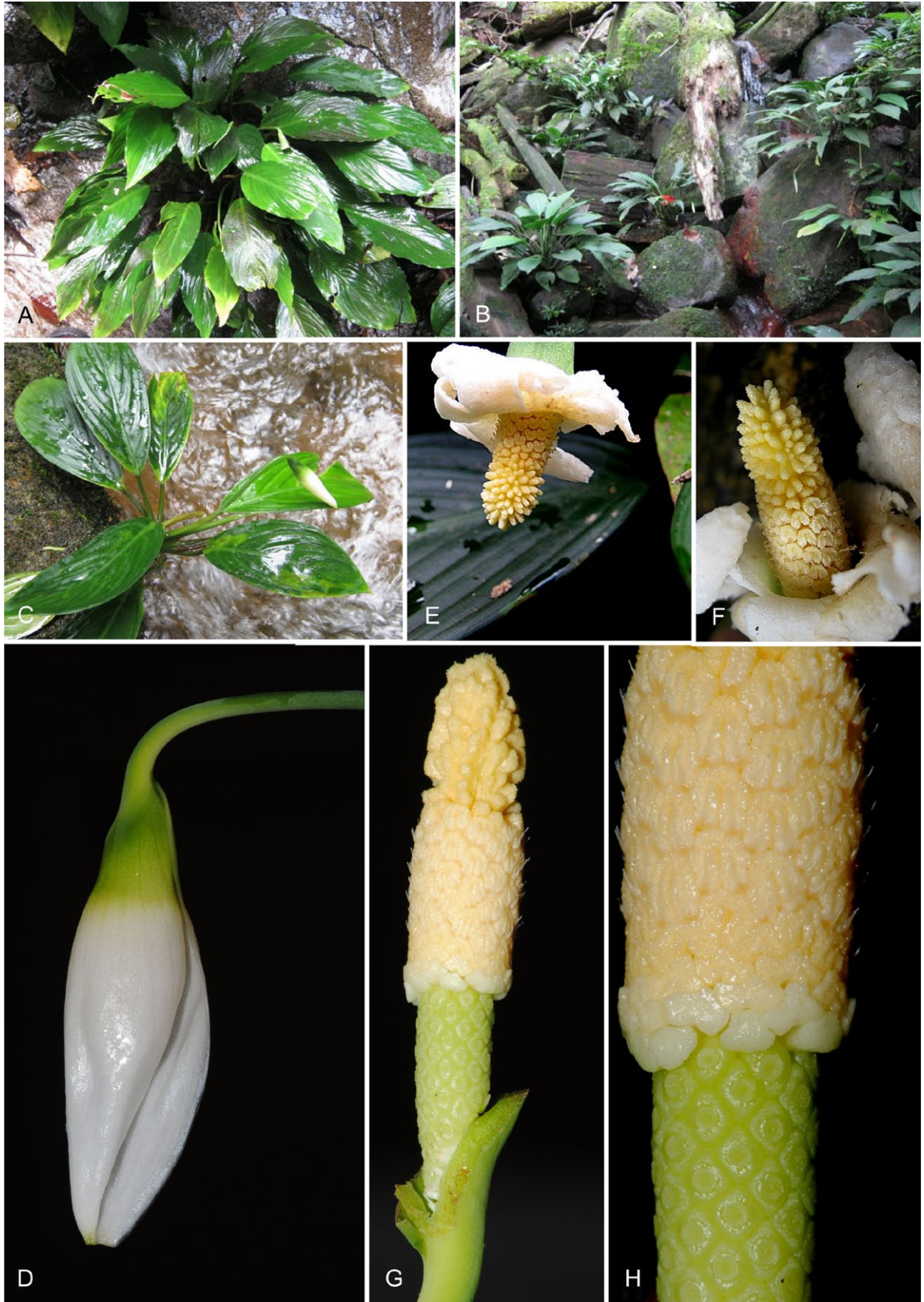
Fig. 2. Aridarum rostratum – A–C: plants in habitat; note the pendent inflorescences visible (B, centre and mid right); D: inflorescence at early pistillate anthesis; E & F: inflorescence at staminate anthesis; note that with the majority of the spathe limb is already shed; G: spadix (spathe artificially removed) at onset of staminate anthesis; H: detail of spadix fertile zones at onset of staminate anthesis; note that the interpistillar staminodes are beginning to expand laterally. – Photograph A from K. Nakamoto AR-3538; B–H from K. Nakamoto AR-3532; A–F by K. Nakamoto; G and H by P. C. Boyce.