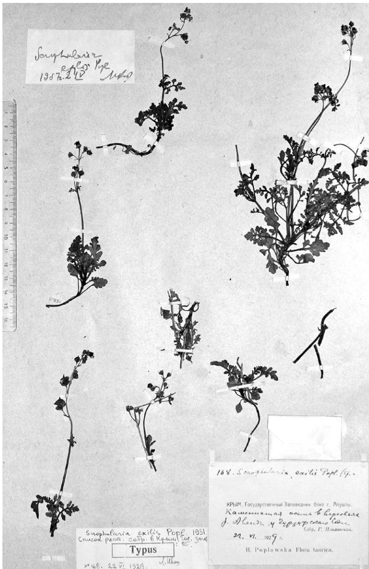
Fig. 2. Holotype of Scrophularia exilis at LE.

on the slope of Mt Shagan-Kaya in the Crimean Nature Reserve, 44°34'44"N, 34°13'36"E, 1345 m, 11 Jun 2012. Both localities were on east-facing rocky scree slopes (Fig. 1A) formed of fragments of Jurassic limestone and divided into relatively stable parts and mobile parts (Fig. 1B). The plants of S. exilis grew only on the mobile parts in three areas (c. 200, 800 and 850 m 2 ) on Mt Djunyn-Kosh and one area (about 2400 m 2 ) on Mt Shagan-Kaya. There were more than 400 individuals on Mt Djunyn-Kosh and more than 700 individuals on Mt Shagan-Kaya.