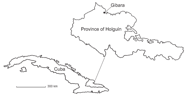
Fig. 3. Geographic distribution of Acanthodesmos gibarensis .