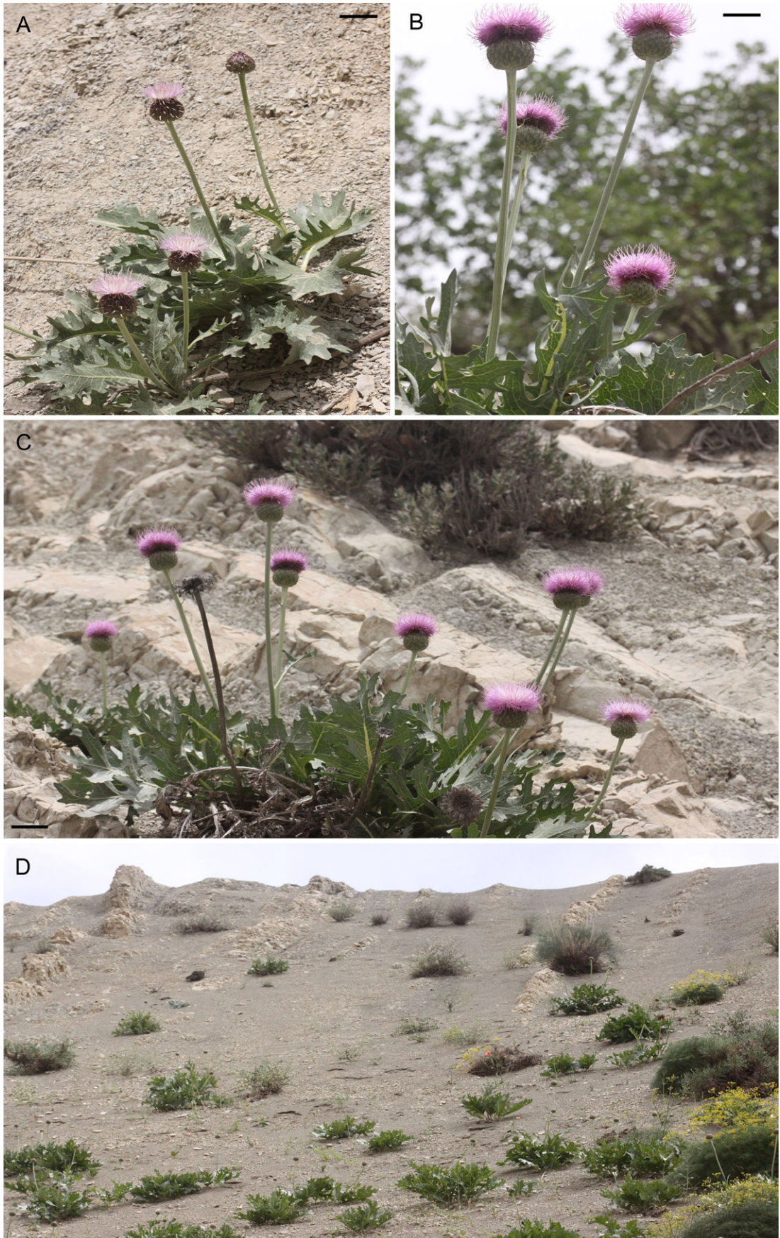
Fig. 1. Klasea paradoxa – A, C: habit; B: capitula with peduncles; C, D: habitat. – A–D: Iran, Lorestan, Malavi to Eslamabad, 25 Apr 2013, photographs by M. Ranjbar. – Scale bars: A = 5 cm; B = 4 cm; C = 6 cm.