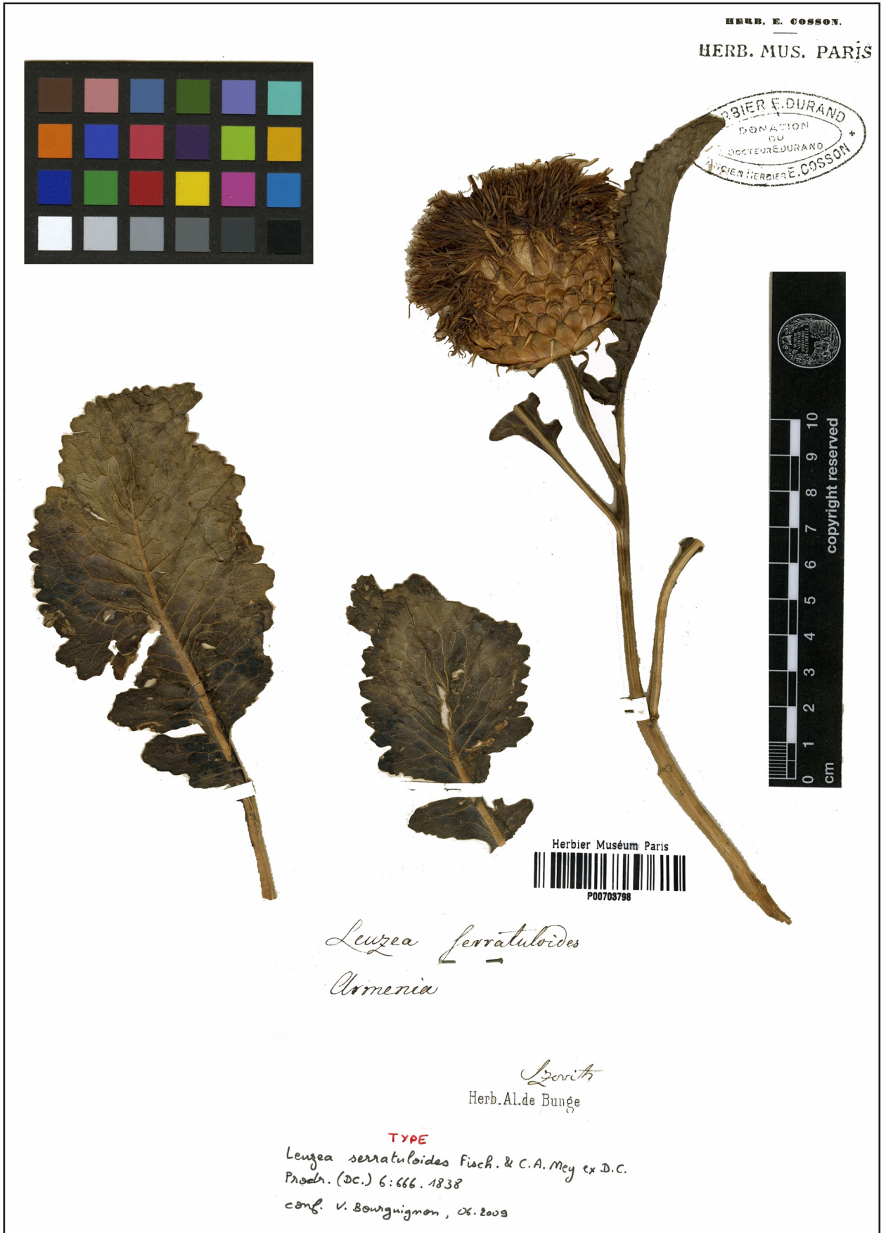
Fig. 4. Isolectotype of Leuzea serratuloides (≡ Klasea serratuloides ) at P.