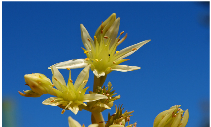
Fig. 3. Close-up of an inflorescence of Sedum ochroleucum subsp. mediterraneum showing petals semi-erect or spreading at anthesis.