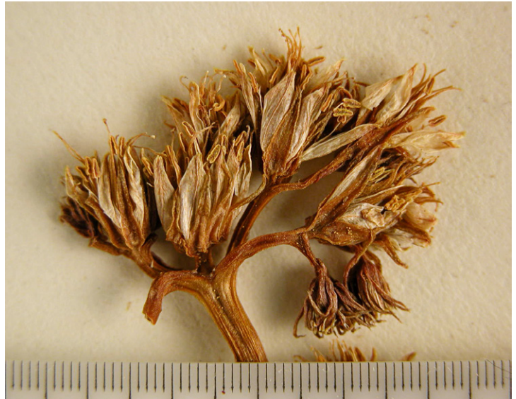
Fig. 2. Close-up of an inflorescence on the holotype of Sedum ochroleucum subsp. mediterraneum . – Scale: lines are 1 mm apart.

Remarks — There is some degree of morphological variability in the S Italian populations of Sedum ochroleucum subsp. mediterraneum , especially regarding sepal length and the filaments sometimes being papillose at the base. This last character, unknown in subsp. ochroleucum , was observed in Campania (M. Alburni, Cilento), Basilicata (between Grassano and Tricarico and between Pignola and Abriola), Apulia (Gargano) and Calabria (Pollino Massif).