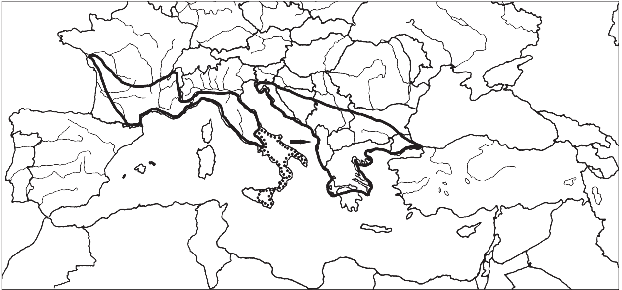
Fig. 5. Distribution of Sedum ochroleucum subsp. ochroleucum (solid line) and S. ochroleucum subsp. mediterraneum (dotted line). The arrow indicates a possible migration route via a former land bridge between Italy and the Balkan Peninsula.