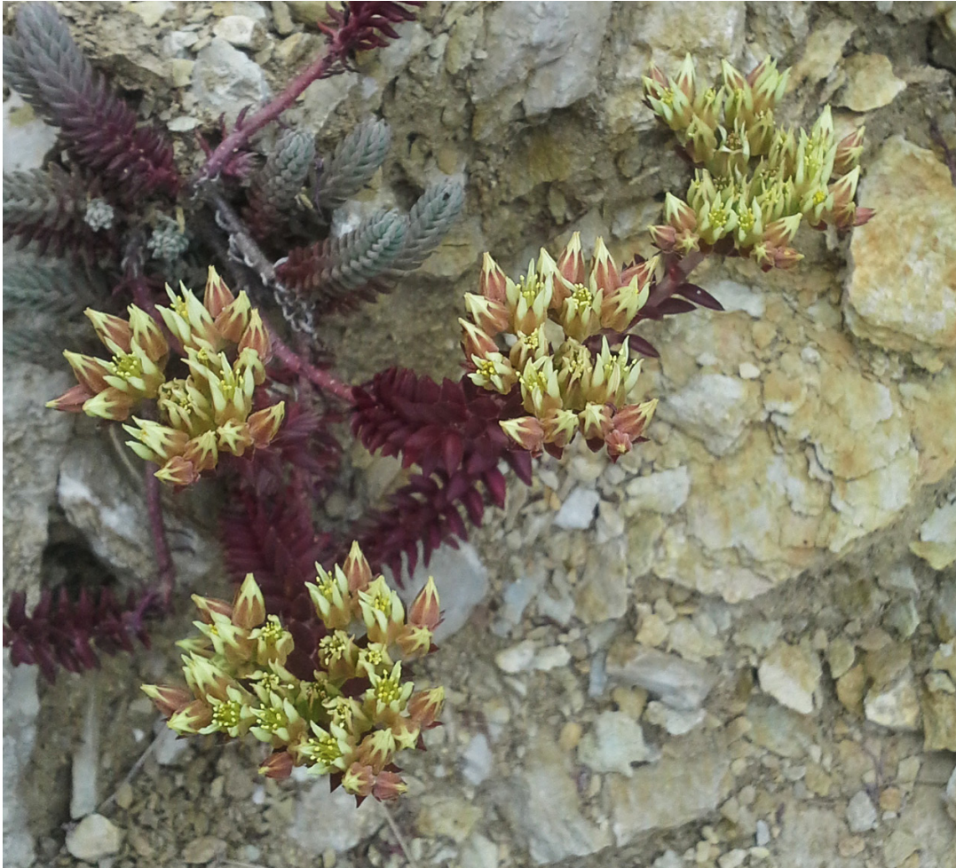
Fig. 4. Individual plant of Sedum ochroleucum subsp. ochroleucum showing petals erect at anthesis. – France, Vercors, 30 May 2013.

validly published S. orthopetalum Thur. & Bornet (see Burnat 1906: 33) now under study.