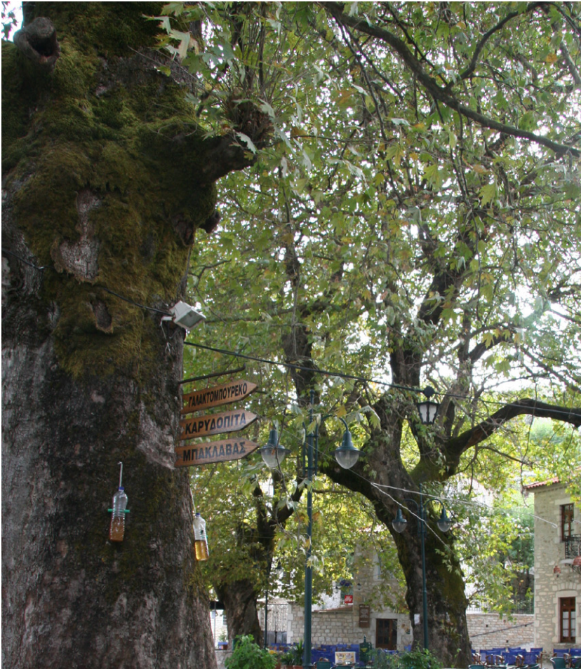
Fig. 2. Plane trees in the square of the mountain village Kosmas (loc. 26) in SE Peloponnisos. The dark patches of the tree trunks are due to Collema furfuraceum and Lepotogium pulvinatum var. quercicola in particular. Also present are L. microphyloides and L. teretiusculum .

Rech. f., Agrimonia eupatoria L. subsp. eupatoria , Bertiera mutabilis (Vent.) DC., Calamintha nepeta , Verbascum glandulosum Delile, Brachypodium sylvaticum , Hellebopus , Plantago major L. On trunks of Platanus trees 30–80 cm d.b.h. – 28 Sep 1997.