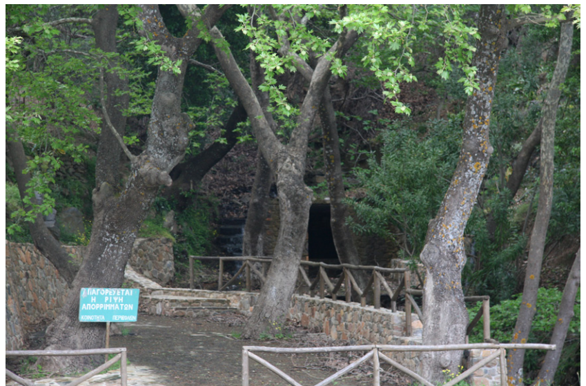
Fig. 4. Closer view of loc. 28. Note the light and dark patches on the tree trunks, representing the Xanthorion and hygrophytic elements of the flora, respectively.

at Agia Paraskevi chapel, 35°19'N, 24°39'E, 380 m. – Riparian Platanus forest on N-facing slope, inclination 20°, with phrygana/maquis. Substrate limestone. On Platanus trees c. 50 cm d.b.h. – 5 Apr 2011.