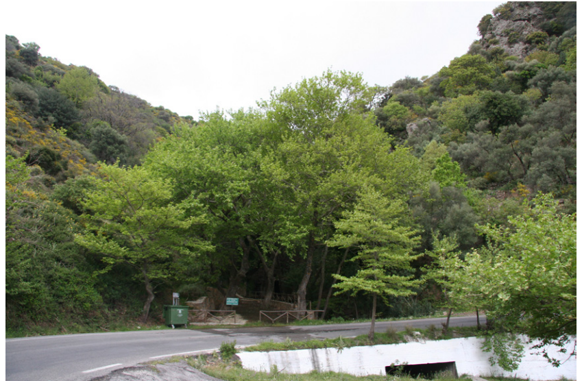
Fig. 3. A riparian plane forest in a small ravine in an area with maquis on the W slope of the westernmost mountains of Kriti (loc. 28). It is a typical representative of riparian plane forests in small ravines in the sense that it is partly modified by picnic amenities at the intersection of the road.

35. Nomos Rethymnis, N foothills of Mt Psiloritis, c. 7 km SW of Perama town, c. 2 km NE of Arkadi monastery,