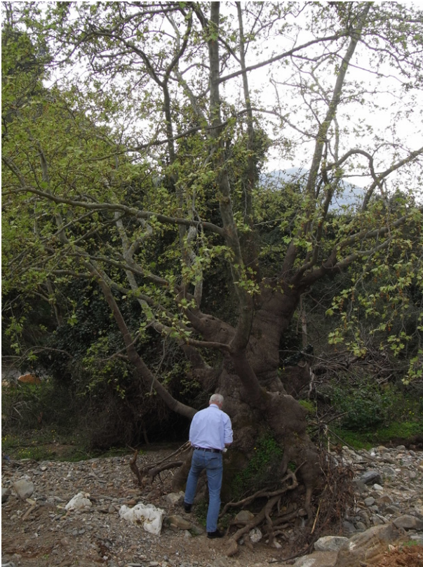
Fig. 5. An old plane tree of an open riparian forest in a summer-dry rivulet (loc. 37). The non-scaly bark of the trunk was covered in dirt from the spring flood. Only three species of lichen were found on this the easternmost locality studied on Kriti, viz.: Bacidia subincompta , Collema auriforme and Leptogium tenuissimum .

deleimon monastery, 35°22'N, 24°58'E, 75 m. – SE-sloping river valley with riparian Platanus forest. River bed dry. On Platanus trees 1–1.75 m d.b.h. – 6 Apr 2011. – Fig. 5.