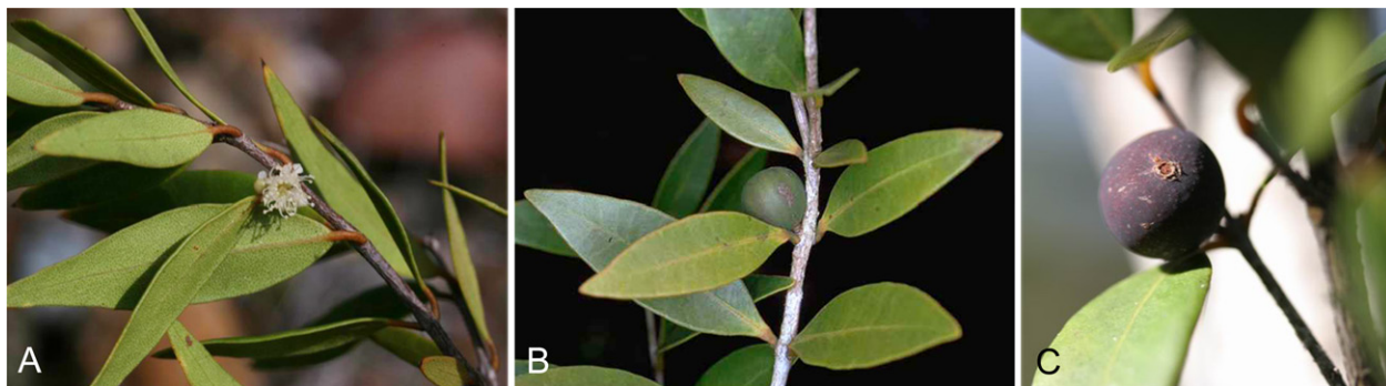
Fig. 2. Plinia bissei – A: leafy branchlet with flower and flower bud; B: leafy branchlet with unripe fruit; C: leafy branchlet with ripe fruit. – Cuba, Prov. Holguín, Yamanigüey, Jan 2004. – Photographs by Zenia Acosta Ramos.

rivers that cross areas of slates. Isolated individuals have been found in other forest types with poorly drained soils.