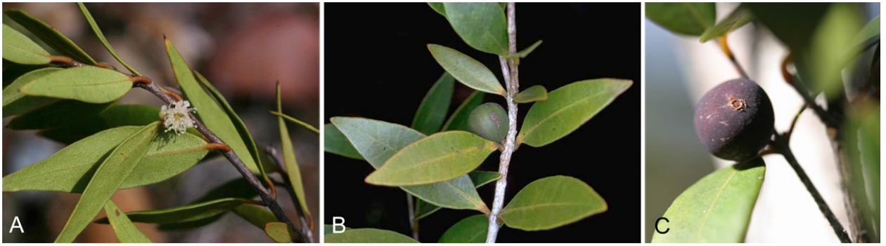
Fig. 2. Plinia bissei – A: leafy branchlet with flower and flower bud; B: leafy branchlet with unripe fruit; C: leafy branchlet with ripe fruit. – Cuba, Prov. Holguín, Yamanigüey, Jan 2004.

rivers that cross areas of slates. Isolated individuals have been found in other forest types with poorly drained soils.