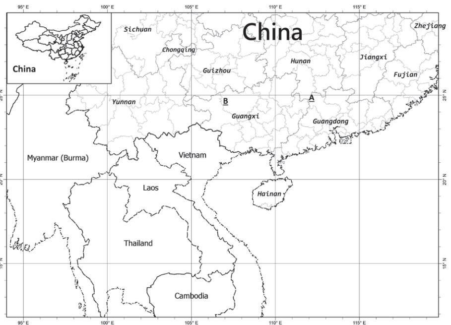
Fig. 1. Known distributions of Primulina argentea (A) and P. fengshanensis (B).

Description — Herbs perennial. Rhizome subterete, 6–9 cm long, 1–1.3 cm in diam.; internodes inconspicuous. Leaves 6–10(–21), opposite, clustered at apex of rhizome; petiole 3–6(–13) × 2–3 cm, densely pilosulous; leaf blade elliptic to obovate-lanceolate, 8–14(–19) × 2–6 cm, thick, chartaceous, both surfaces densely appressed sericeous-villous, hairs on both surfaces and on other parts of plant simple, multicellular, base cuneate-attenuate, margin entire, apex attenuate or with a curved beak; lateral veins 3–5 on each side, abaxially slightly prominent, adaxially unapparent. Inflorescence cymose, each plant bearing 7–10 flowers borne in 3–8 cymes; peduncle 10–14 cm long, c. 0.3 mm in diam., sparsely appressed pubescent with both glandular and eglandular hairs, hairs simple, multicellular; cymes 1- or 2-branched, branches (1 or) 2–6-flowered; bracts 2, opposite, oblong, 3.5–3.7 × c. 1 cm, both surfaces densely appressed sericeous-villous, base obtuse, margin entire, apex acuminate; bracteoles 2, opposite, oblong-lanceolate, c. 0.2 × 0.1 cm, with same indumentum as on bracts, margin entire, apex acute; pedicels 1.3–1.5 cm long, sparsely glandular pubescent. Calyx 5-parted to base; lobes narrowly lanceolate, 0.9–1.1 × 0.1–0.15 cm, glandular pubescent on both surfaces, hairs simple, multicellular, margin entire, apex acute. Corolla brownish purple, 4–5 cm long, out-