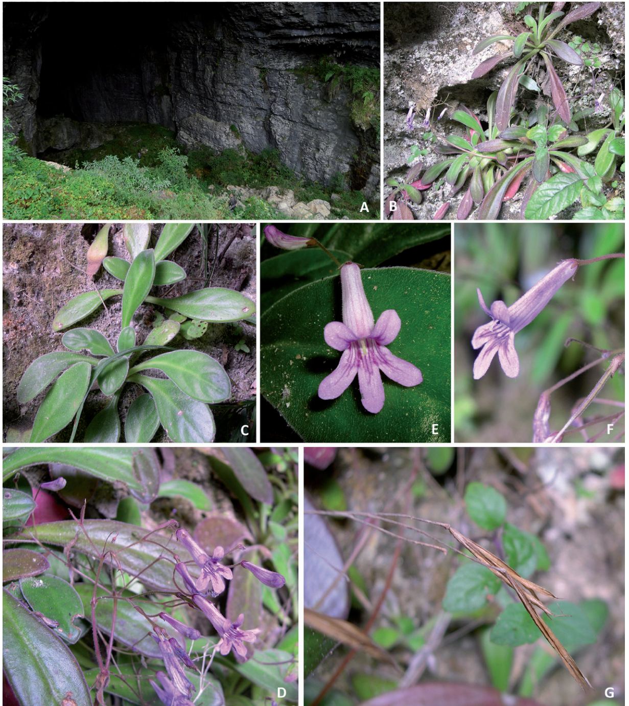
Fig. 4. Primulina fengshanensis – A: habitat; B: habit; C: leaves; D: cyme; E: frontal view of flower; F: lateral view of flower; G: dehiscent capsules. – Photographs by Fang Wen, type locality of P. fengshanensis (see Remarks), 1 Oct 2010.

habitat to survive. If the cave is disturbed or destroyed, the population of this new species might rapidly decline or even disappear. Therefore, we propose that Primulina argentea should be considered Critically Endangered: CR B1ab(iii)+2ab(iii) according to the IUCN Red List categories and criteria (IUCN 2012).