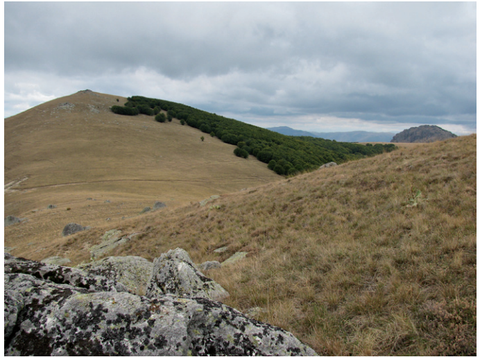
Fig. 3. At 1750–1800 m the upper limit of the Fagus woodland with its sharp margin is clearly a result of the upper part of the woodland having been cut and the area subsequently subjected to grazing, resulting in montane grassland. On the granite outcrop in the foreground a community mainly of Umbilicaria cylindrica and U. polyphylla is present. Mt Vitsi (loc. 3).

*** Parmelia serrana A. Crespo & al. – On N and E sides of boulders and outcrops of gneiss and granite. (1) 14785; (4) 14846; (5) 14755. – Parmelia ernstiae , P. saxatilis and P. serrana are rather similar species. They share a number of characters, which they express to different degrees; they are therefore distinguished by a combination of characters, most of which are not exclusive to any of the species (Thell & al. 2011). Specimens with rather broad and overlapping marginal lobes, branched as well as simple rhizinae, marginal isidia in addition to laminal isidia (the latter mainly on ridges in peripheral parts but may also cover large patches of the central part of the thallus), no or occasionally little pruina, upper surface ± foveolate and no lobules or rarely with lobules developed from isidia in the older part of the thallus are