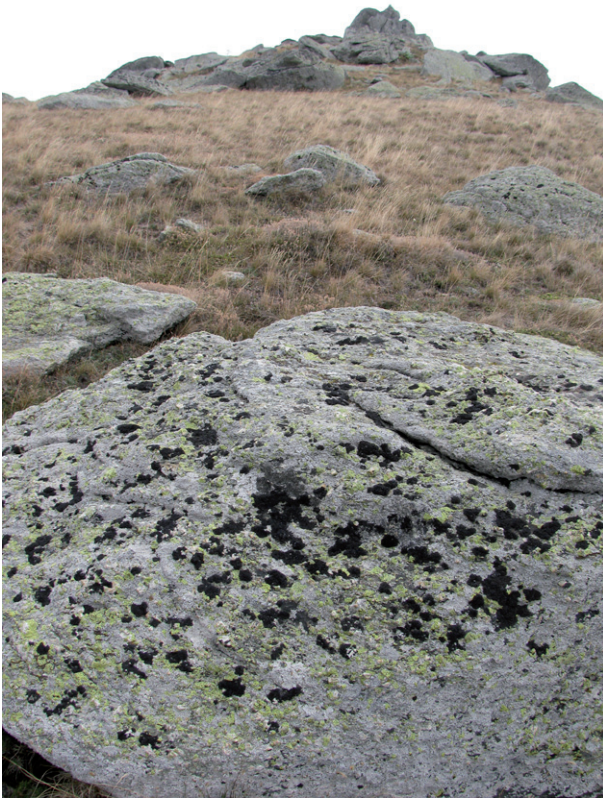
Fig. 2. Granite outcrops in montane grassland at 1750–1800 m on Mt Vitsi (loc. 3). Note the population of Cornicularia normoerica in the foreground (many of the dark patches, which also include specimens of Umbilicaria deusta and U. polyphylla ).

montane grassland in large opening in Fagus woodland. – 17 Sep 2013.