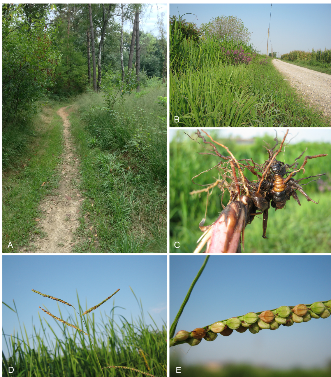
Fig. 1. Paspalum thunbergii in Italy. – A: forest path in Boscaccio; B: roadside ditch in Mortara; C: rhizome; D: inflorescence; E: spikelets. – A: Boscaccio, photographed in August 2015 by Guido Brusa; B–E: Mortara, photographed in August 2015 by Nicola Ardenghi.

pubescent, especially along the margins (vs acuminate at the apex, with long-ciliate margins). Moreover, P. thunbergii typically has upper glumes that are 3-veined with a very prominent central vein and marginal lateral veins (vs 5–7-veined upper glumes in P. dilatatum ). Also, both species are ecologically rather different (see below). Paspalum thunbergii and P. dilatatum locally have likely been confused in Italy or elsewhere in Europe. However, a revision of herbarium specimens of the latter in some herbaria (BER, BR, HBBS, GENT, MSNM, PAV and TO; acronyms according to Thiers [continuously updated]) only yielded one supplementary record of P. thunbergii (see specimens examined).