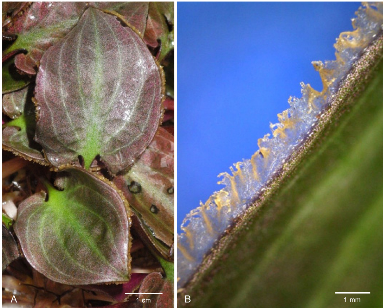
Fig. 4. Cryptocoryne aura – A: leaf showing surface patterns and transparent margin; B: close-up of transparent margin (the “aura”) with ciliate trichomes.

viously been reported for Cryptocoryne , and from this number alone it is not possible to say anything about relationships (Arends & al. 1982). The basal chromosome numbers of x = 10, 11, 15, 17 and 18 have been recorded for Bornean species; x = 10 has been found in the Bornean C. hudoiroi Bogner & N. Jacobsen, C. ideii , C. keei N. Jacobsen and C. striolata Engl.; x = 11 has been found in the widespread SE Asian C. ciliata ; and x = 14 has been found in the Sri Lankan group around C. beckettii Thwaites ex Trimen. However, the morphology and the chromosome number together do not provide any clue as to relationships between C. aura and other Cryptocoryne species.