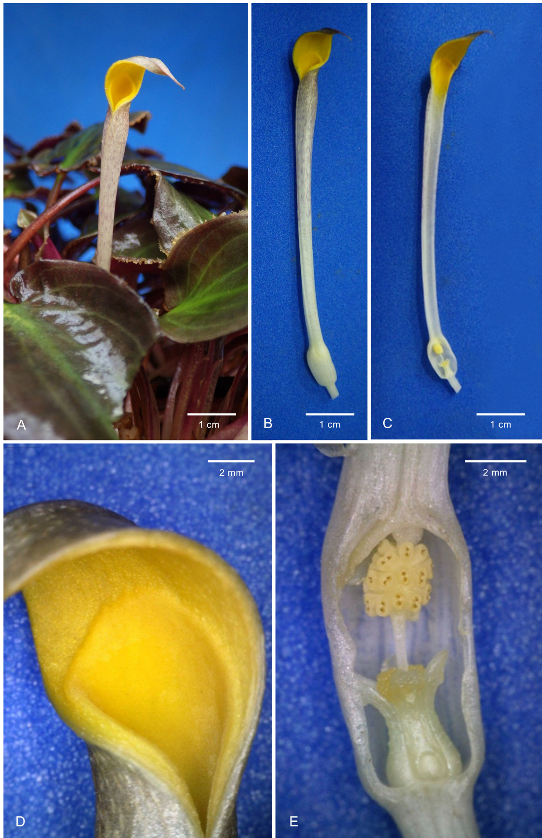
Fig. 5. Cryptocoryne aura – A: plant showing limb of spathe slightly subobliquely twisted (older spathe); B: limb of spathe bent forward at a younger stage than in A; C: spathe longitudinally cut open showing kettle in lower part; D: limb of spathe showing slightly raised collar; E: opened kettle showing female flowers below, olfactory bodies (yellow) above, sterile interstice, and male flowers above. – Photographs by S. Wongso.