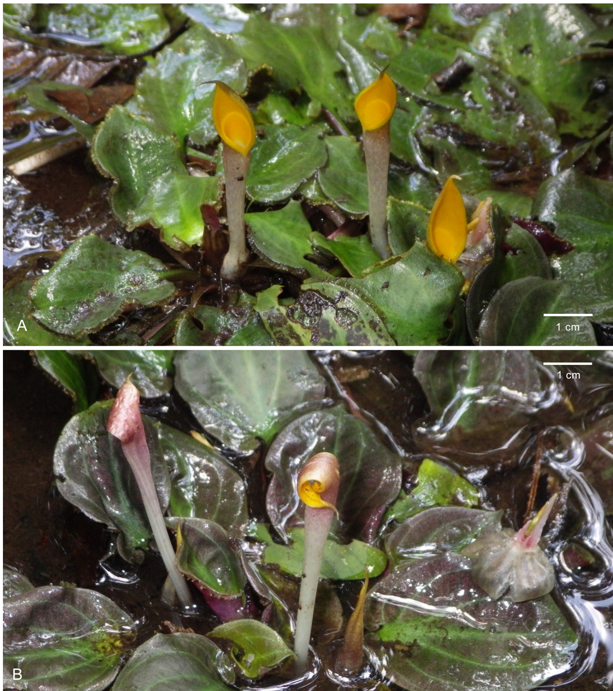
Fig. 3. Cryptocoryne aura , close-up of plants in Fig. 2. – A: newly opened spathes showing subobliquely twisted limb; B: older spathes showing forward-twisted limb. – Photographed on 26 February 2015 by S. Wongso.

Most species of Cryptocoryne have a rather undifferentiated embryo, which pushes through the distal end of the seed (micropylar end), and the root hairs can be seen at the “tip” of the embryo; just behind that, the plumular processes (prophylls) are seen pointing “backwards”. After further growth, more roots and leaves appear. Most of the embryo remains inside the seed, where it serves to absorb the endosperm in order to feed the growing embryo during the initial stages. There are a few exceptions to this simple embryo in