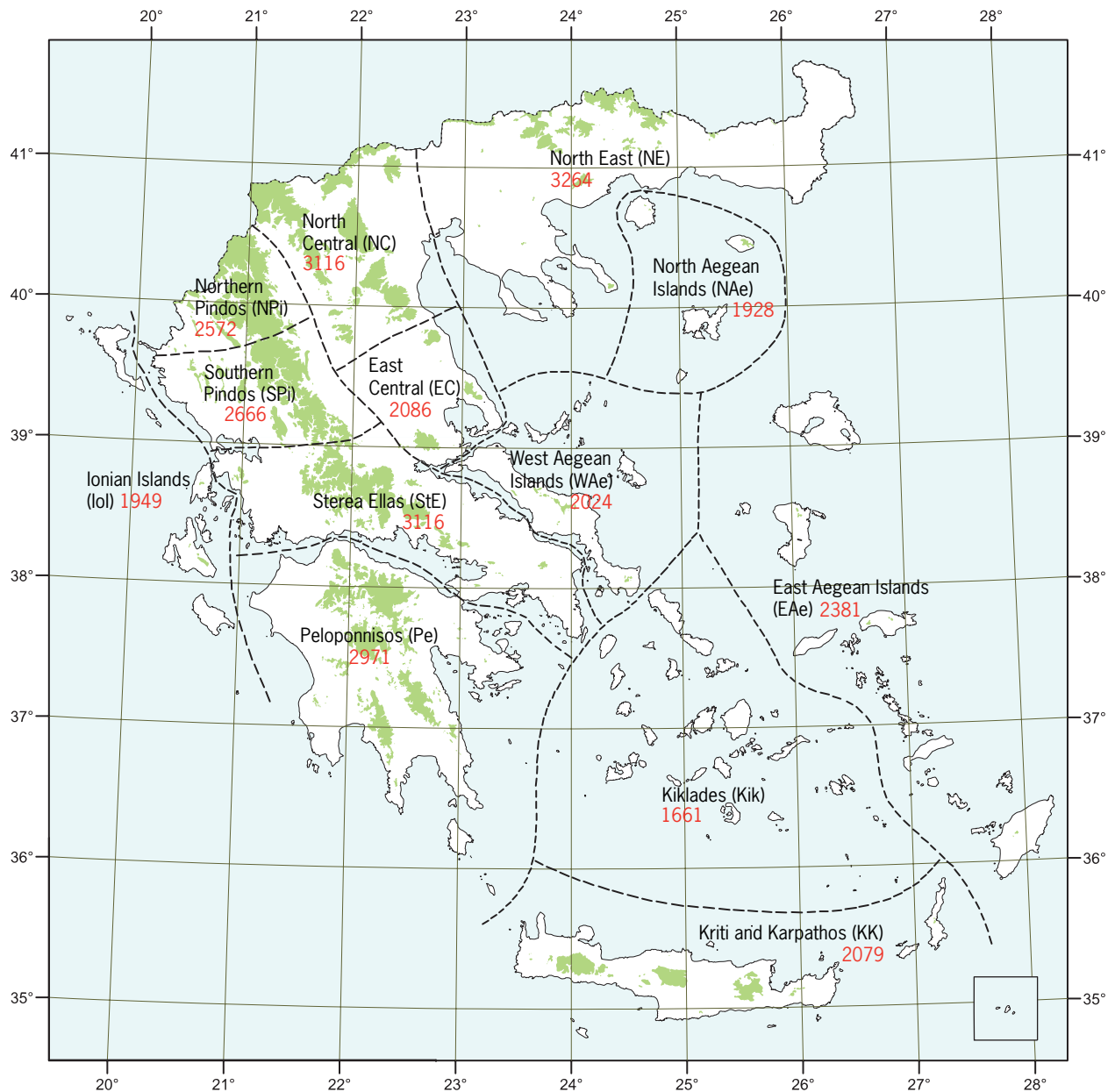
Fig. 1. Vascular plant species in each of the 13 floristic regions of Greece.

descending order. The floristic regions of NPi, KK, WAe and IoI each have the same number of families (146 families) (Table 2).