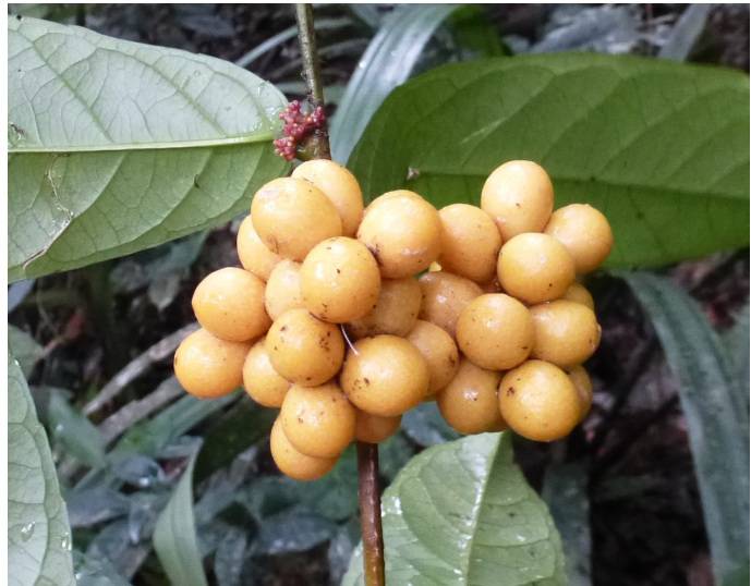
Fig. 1. Decorsella paradoxa showing berry-like seeds from two fruits. – Photographed by Carel Jongkind in Liberia from Jongkind & al. 11998.

Decorsella arborea Jongkind, sp. nov. – Fig. 2A–N. Holotype: Gabon, Ngounié, Missionary Station at Mouya-