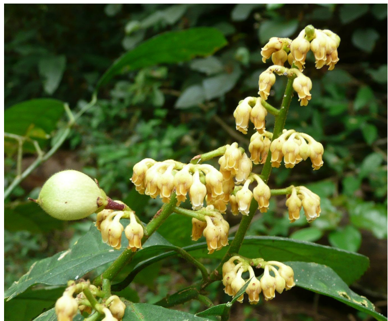
Fig. 4. Rinorea longicuspis showing zygomorphic flowers with longest (anterior) petal ending straight and flat. — Photographed by Carel Jongkind in Liberia from Jongkind & al. 9192 .