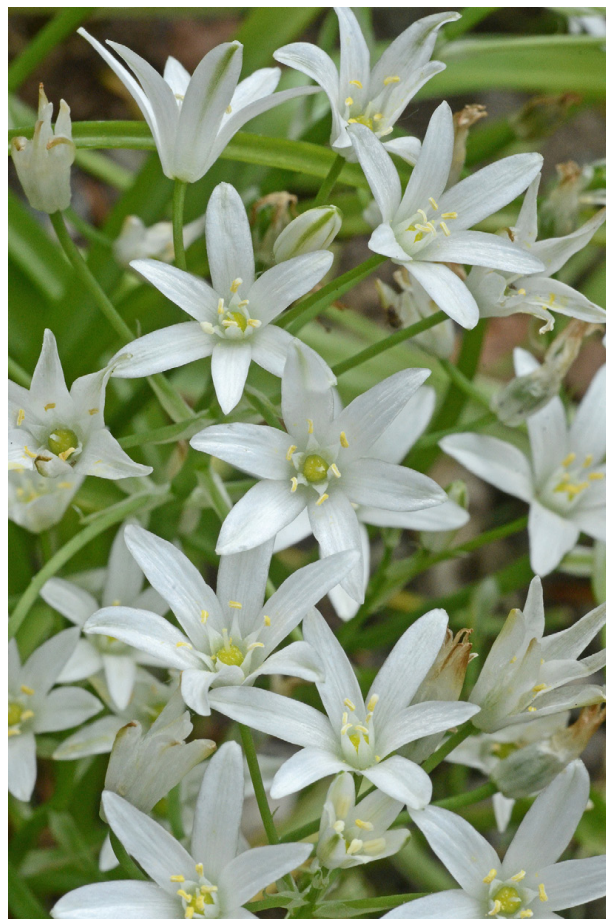
Fig. 3. Ornithogalum naxense – cultivated in Ørbæk, Denmark, 23 May 2017, photograph by A. Strid; collected from Greece, nomos of Kiklades, Naxos, N side of Mt Koronos, 600 m, 28 May 2013 (Strid 57773).