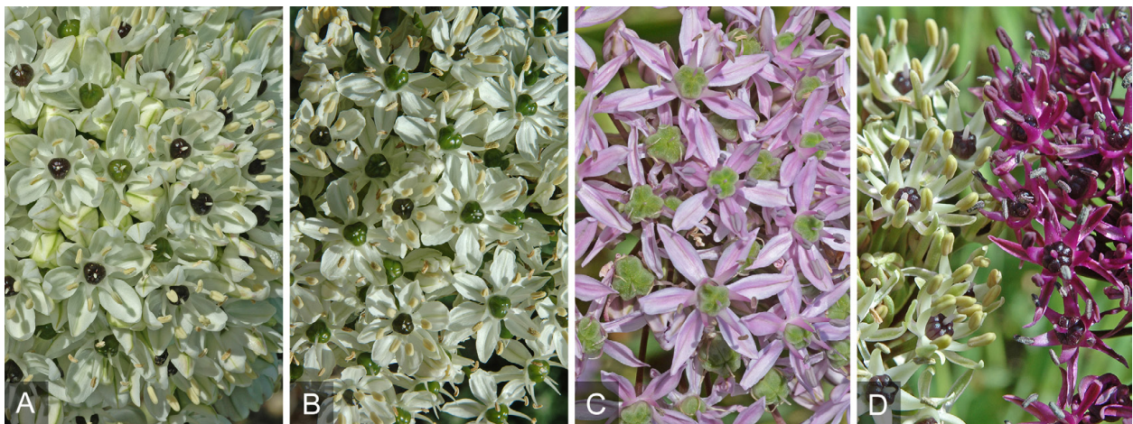
Fig. 1. Comparison of flowers of Allium melanogyne , A. nigrum and A. cyrilli from Greece. – A: Allium melanogyne , cultivated in Ørbæk, Denmark, 28 Jun 2012; collected from nomos of Evros, eparchia of Soufli, by ecotouristic station near village of Dadia, 100 m, rocky outcrop, 31 May 2010, Strid 57037 (G, herb. Strid). – B: Allium melanogyne , cultivated in Allerød, Denmark, later in Göteborg Botanical Garden, Sweden, 28 Jun 2006; collected from island of Lesvos, eparchia of Mitilini, 2–3 km from Sanatorio Agiasou along road to Plomari, 700–800 m, open Castanea forest and meadows, 27 Apr 1987, Strid & al. G87-67 (bulb collection). – C: Allium nigrum , island of Samos, 1 km from Chora toward Pythagorion, 40 m, traditionally cultivated field with many weeds, 19 Apr 2017. – D: Allium cyrilli , colour forms growing side by side; island of Chios, just NE of village of Kalimasia, 100–150 m, loamy hills with terraced mastic and olive groves, 25 Apr 2009. – Photographs by A. Strid, not shown at same scale.

In addition to Allium nigrum and A. melanogyne , a third member of A. sect. Melano-