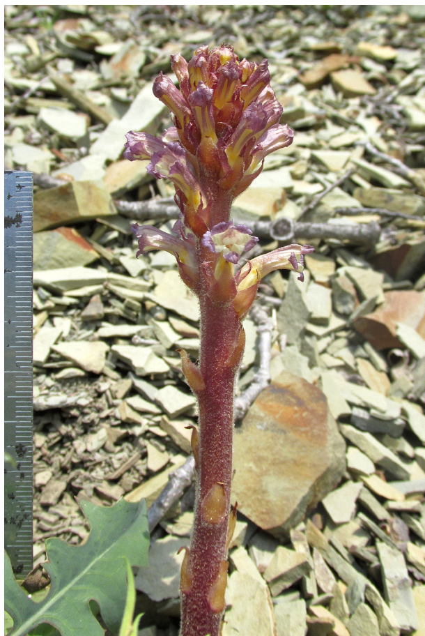
Fig. 4. Orobanche grenieri – Russia: Krasnodar territory, Anapa district, vicinity of Bolshoy Utrish, 9 Jun 2017, photograph by A. V. Fateryga.

+ Rf(S) : Russia, S European Russia: Volgograd province, Ilovlya district, 49°06'25.9"N, 44°07'17.1"E, 85 m, fallow land, parasitic on Lactuca tatarica (L.) C. A. Mey., 22 Jun 2016, D. Bochkov (photo).