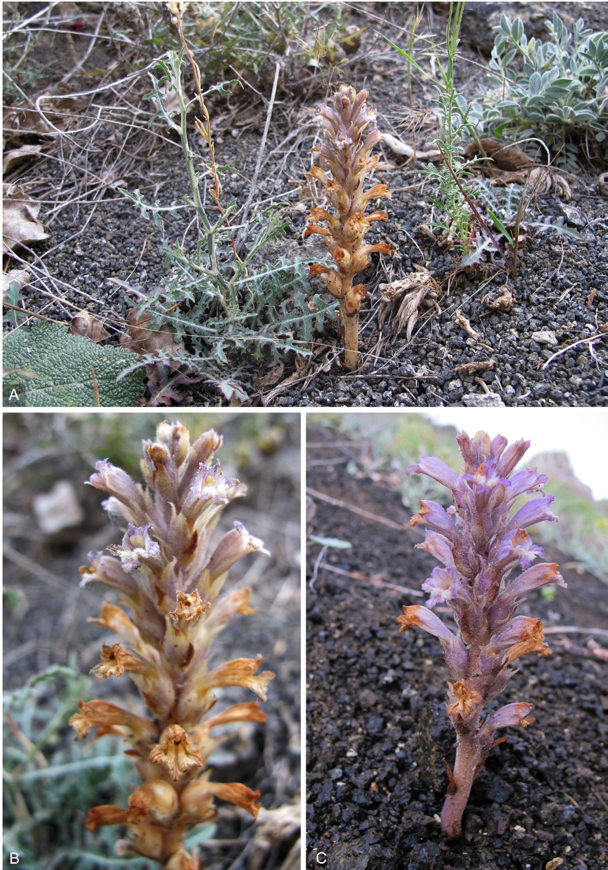
Fig. 6. Phelipanche sinaica . – A: flowering plant in habitat with host, Lactuca cf. viminea ; B: flowering spike; C: habit of flowering plant. – A, B: Azerbaijan: Talysh, NE side, near Şonaçola, 26 May 2013; C: Azerbaijan: Talysh, c. 2 km NE of Mistan, 27 May 2013; all photographs by S. Rätzel.