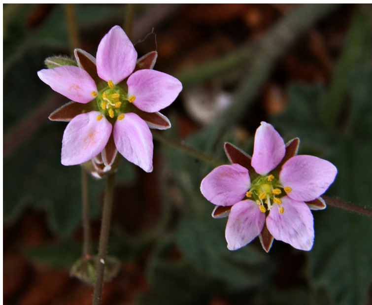
Fig. 1. Flowers of Rhodalsine geniculata from Spain, Lagunas de La Mata, Torrevieja, April 2012