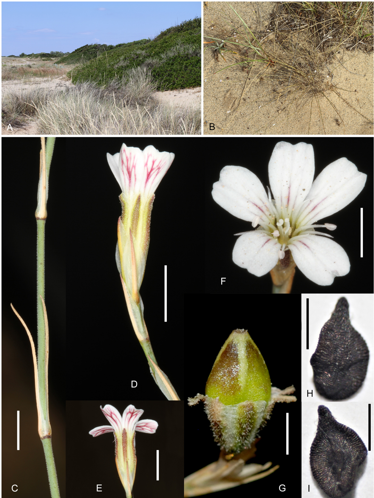
Fig. 2. Petrorhagia laconica – A: sand-dune habitat NW of Neapoli village in SE Peloponnissos with evergreen shrubs (locus classicus), 22 May 2017; B: individual with simple, procumbent-ascending stems at the locus classicus, 16 May 2014; C: middle part of stem with leaves; D: upper part of stem with flower; E: flower, lateral view; F: flower, apical view; G: immature capsule; H: seed, dorsal face; I: seed, ventral face. – Scale bars: C–F: 3 mm; G: 1 mm; H, I: 500 \mu m. – All photographs by Panayiotis Trigas except G by Eleftherios Kalpoutzakis.