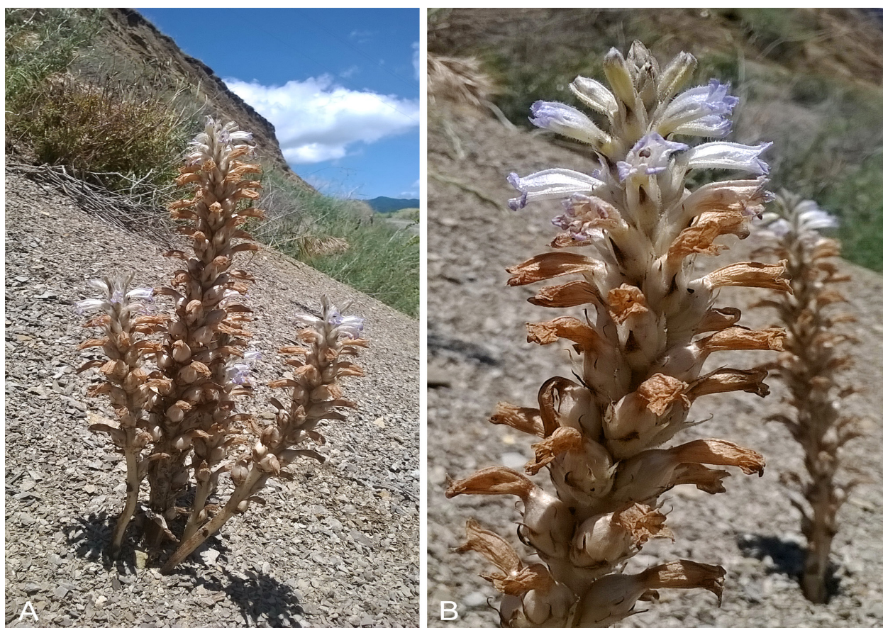
Fig. 8. Phelipanche kelleri – A: habit in late flowering and early fruiting stage; B: detail, upper part of inflorescence. – Georgia: Sarkinetis Kedi, 11 May 2017, photographs by A. Gröger.

Phelipanche orientalis (Beck) Soják (≡ Orobancha orientalis Beck). – Fig. 9.