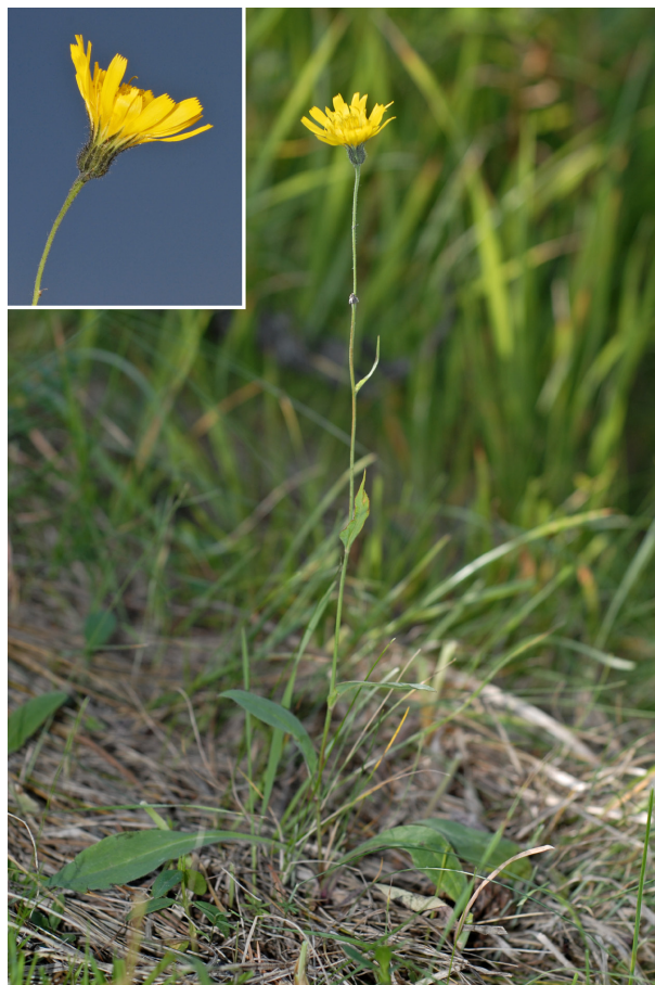
Fig. 5. Hieracium stenoglossophyllum – Serbia: Šar Planina, Ošljak, 30 Jul 2008, photographs by M. Niketić.

H. sparsum subsp. naegelianiforme O. Behr & al., from which it is distinguished by its (almost) glabrous peduncles. Š. Duraki & M. Niketić