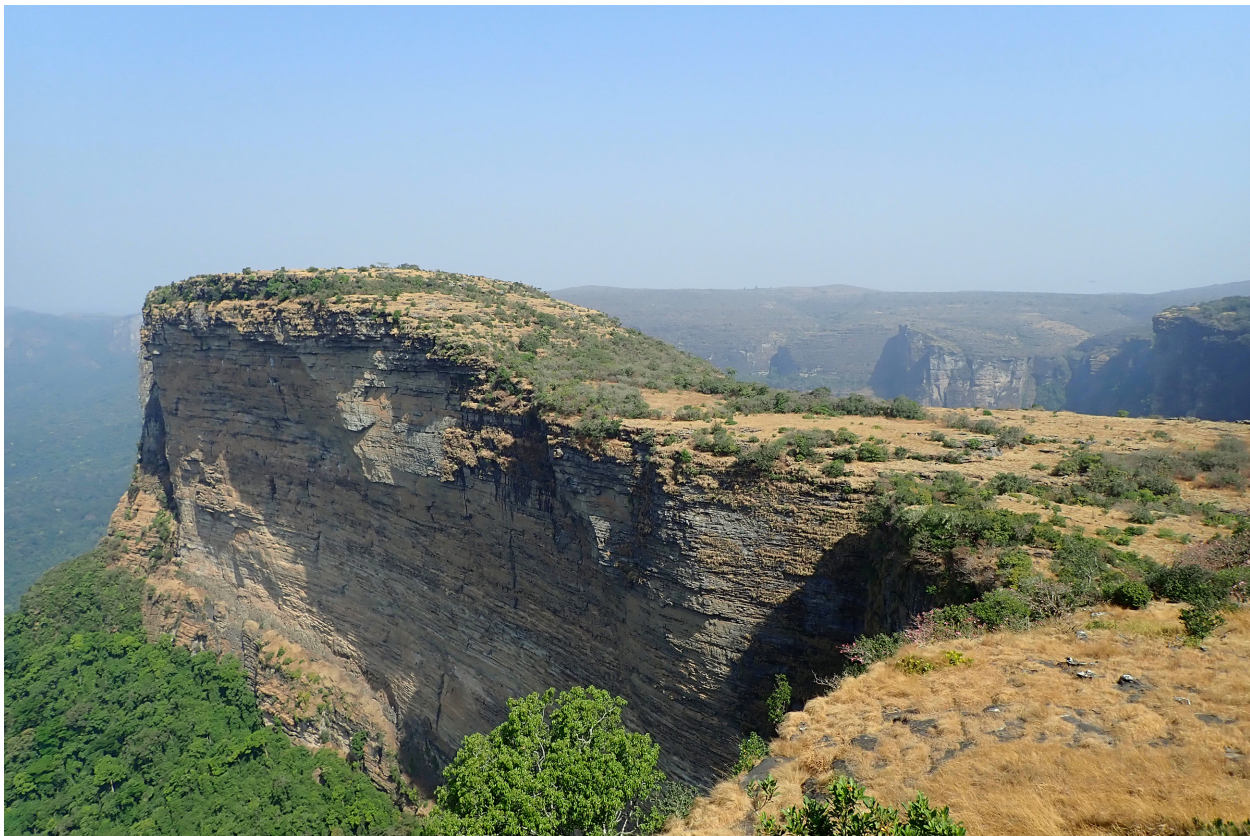
Fig. 6. Submontane wooded grassland vegetation in the Kounounkan Massif. Gladiolus mariae was collected on this 1020 m high hill and was also observed there, growing on vertical sandstone cliffs. In some years the vegetation on the hill is not subject to the annual dry season fires because it is separated from the main plateau by a narrow, 350 m long canyon. – Photograph taken on 7 Feb 2019 by Xander van der Burgt.

In Afromontane shrubland, fire has often favoured the spread of grasses at the expense of the shrubs (White 1983: 49). Anthropogenic fires are usually ignited in the dry season when lightning-ignited fires would not normally occur (Archibald & al. 2012) and have a large influence on species composition and structure of the vegetation (Bond & al. 2005; Staver & al. 2011).