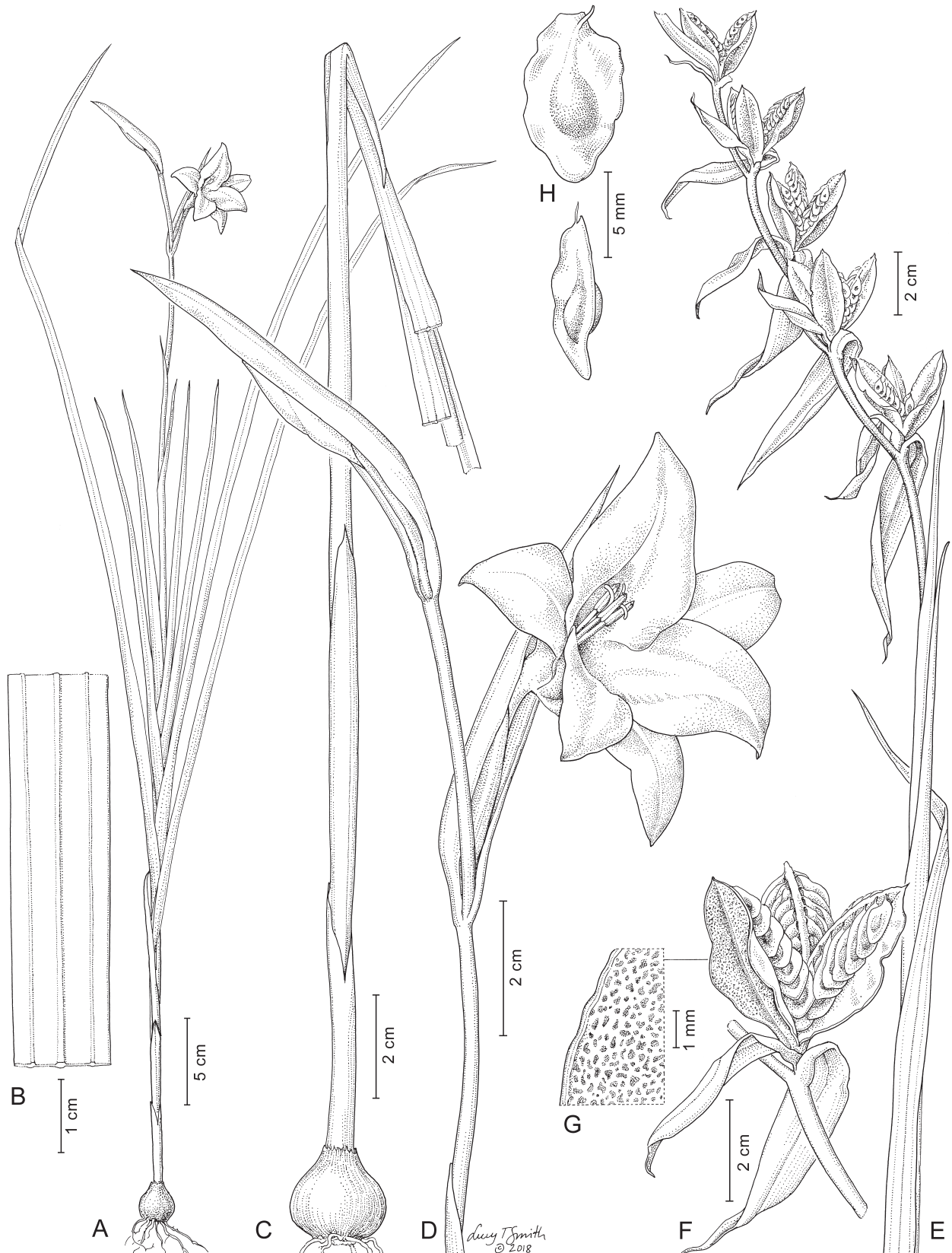
Fig. 2. Gladiolus mariae – A: flowering plant; B: detail of leaf; C: base of plant showing corm and 3 cataphylls; D: upper part of plant with an open flower and a flower bud; E: upper part of fruiting plant with 5 mature fruits; F: mature, open fruit with seeds; G: detail of dotted epidermis of fruit; H: seeds. – Origin: A–D from Burgt & Haba 2012 (type gathering); E–H from Burgt 2161. – Drawing by Lucy T. Smith.