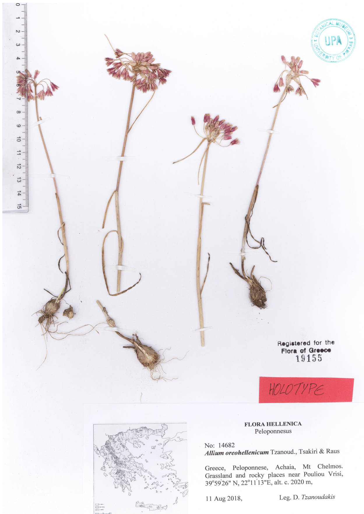
Fig. 4. Holotype of Allium oreohellenicum Tzanoud., Tsakiri & Raus, Tzanoudakis 14682 (UPA).