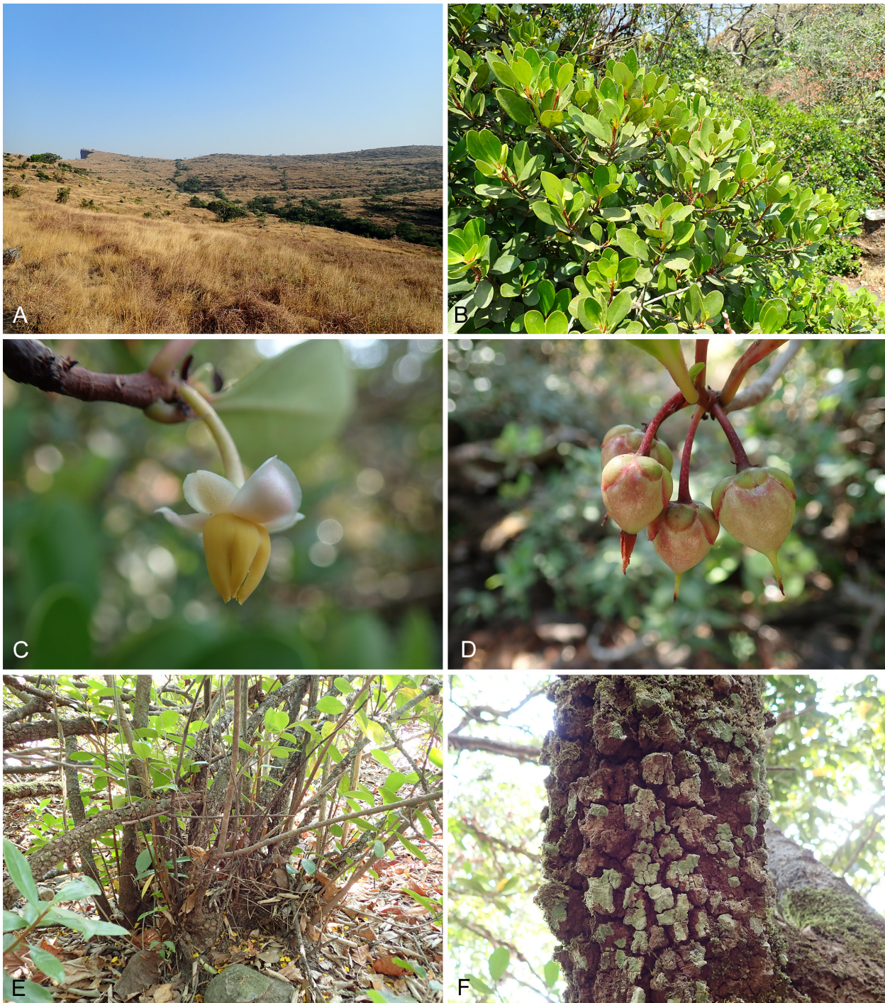
Fig. 2. Ternstroemia guineensis – A: habitat, submontane gallery forest in sparsely wooded grassland; B: habit; C: flower; D: fruits; E: base of a multi-stemmed shrub; F: bark of a tree, trunk c. 18 cm in diam. – Photos: Republic of Guinea, Kounounkan Massif, Feb 2019, Xander van der Burgt.

concave, thick, leathery, outer surface wrinkled when dry, unequal, outer pair suborbicular, c. 4.5 \times 5.2 mm, leathery, margin scarious, 0.5–1 mm wide, erose, apex rounded or retuse, sometimes with mucro 0.3–0.4 mm long, inserted adaxially below margin; inner sepals ovate, c. 6.5 \times 6 mm, mucro absent, margin as outer sepals. Petals 5 (or 6), yellow or yellowish white, together forming a short cylinder enclosing stamens, petals imbricate, connate in basal \frac{1}{4} (for 1.7–2 mm, Fig. 1F, 2C), each nar-