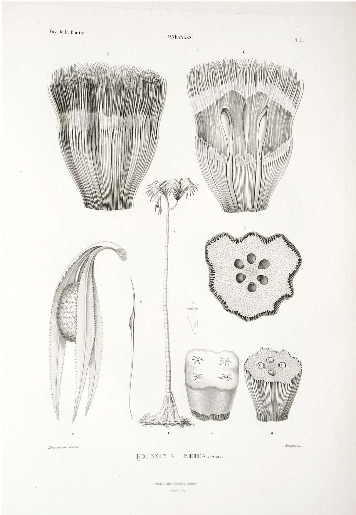
Fig. 5. Lectotype of Roussinia indica ( \equiv Pandanus indicus ): copper engraving in Gaudichaud-Beaupré, Voy. Bonite, Bot. 3: t. 21 , fig. 1–4. 1841 (only the parts numbered 1–4).