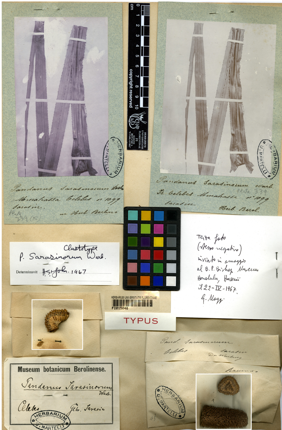
Fig. 6. Lectotype of Pandanus sarasinorum : Sarasin 1099 (FI015048). – Image © Università degli Studi di Firenze, Museo di Storia Naturale, Collezioni Botniche.