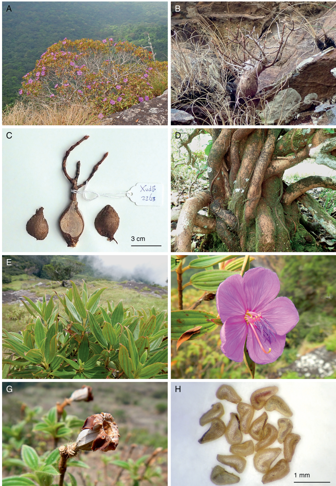
Fig. 1. Cailliella praeuptycola . – A: flowering plant on top of a vertical cliff, 27 Nov 2017; B: juvenile, c. 23 cm tall plant with pachycaulous base, 5 Feb 2019; C: juvenile, c. 10 cm tall plant with pachycaulous base, 5 Feb 2019; D: stem base of mature plant, with several stems and adventitious roots, 18 Oct 2018; E: mature, sterile plant with leaves, during the wet season, 25 Sep 2016; F: flower, 27 Nov 2017; G: fruit, still with seeds inside, 16 Apr 2017; H: seeds. – Origin: A, F from Burgt 2159; B, C from Burgt 2263; D from Burgt 2204; E from Haba & Burgt 428; F from Burgt 2159; G, H from Burgt 2106. – All photographs by Xander van der Burgt.