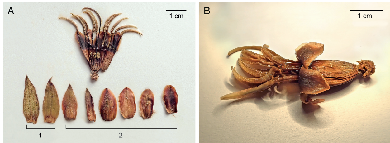
Fig. 3. Cailliella praerupticola . – A: dissected flower; 1: pair of leaves subtending flower; 2: three pairs of bracts subtending hypanthium; B: flower with petals removed. – Origin: A, B from Burgt 2159 .

Habitat and ecology — Cailliella praerupticola occurs on hills in a sandstone plateau. The species is found in fire-free open shrubland vegetation and on vertical cliffs, at 430–1170 m elevation. The species is not at all resistant to the annual anthropogenic dry-season grassland fires that affect the vegetation of large areas in rural Guinea. On the southern Kounounkan Plateau and the Banga Guemey table mountain, C. praerupticola was found to be abundant and locally dominant in five patches of open shrubland vegetation, each 1–4 hectares, at 650–950 m elevation (Burgt & al. 2019). This shrubland is remarkably poor in grasses. Three soil samples taken under this vegetation contained no charcoal at all, although many wood pieces were present. These patches of shrubland may have been protected from fire because they are remote and surrounded by vertical rock cliffs and sub-montane forest (Burgt & al. 2019). These five patches, with