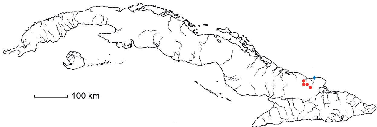
Fig. 4. Distribution of Harpalyce greuteri . The red dots indicate the localities where the species was previously collected but not relocated during our field work. The blue diamond indicates Bahía Naranjo, the type locality where the species has been relocated.

The distribution area of the species is very fragmented, and apparently very reduced from its former extent. The area of occupancy (AOO) in Bahía de Naranjo, where approximately 50 individuals occur, is less than 2 km 2 . At the localities El Paraíso and San Marcos the species probably no longer exists. We estimate that in the other two well-preserved localities Las Margaritas and El Mocho there could be a similar number of plants as at Bahía de Naranjo, and we predict that the total number of surviving individuals of Harpalyce greuteri is approximately 150 and that the AOO in these two other well-preserved localities is each less than 2 km 2 . Applying IUCN conservation assessment criteria (IUCN 2017), H. greuteri can be considered Endangered (EN) under the criteria B1ab(i,ii,iii,iv,v)+2ab(i,ii,iii,iv,v). The existence of H. greuteri together with other narrowly restricted Cuban endemics, mentioned above, on this small patch of serpentine outcrop, deserves urgent conservation attention.