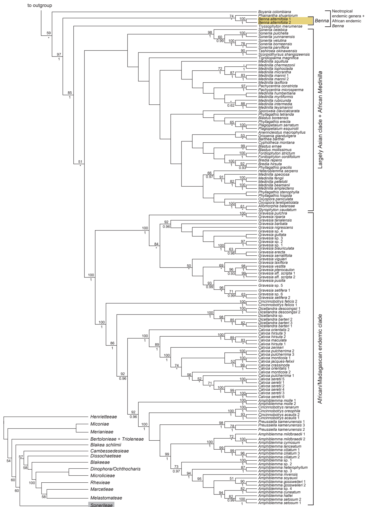
Fig. 1. Phylogeny showing the position of Benna alternifolia within the tribe Sonerileae.