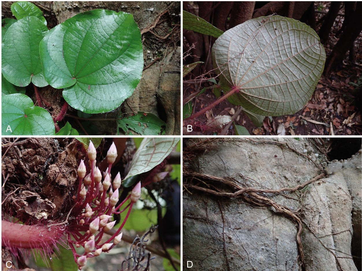
Fig. 4. Benna alternifolia – A: leaf upper surface; B: leaf lower surface; C: inflorescence with flower buds; D: roots. – Origin: A, D from Burgt & Haba 2333; B, C from Burgt & al. 2274 (type gathering).

collections from the Benna Plateau, Burgt & al. 2274, 2323 and Burgt & Haba 2333, represent a new, monotypic genus. The genus is named Benna Burgt & Ver.-Lib. and the species is named Benna alternifolia Burgt & Ver.-Lib. in the taxonomy section of the present manuscript.